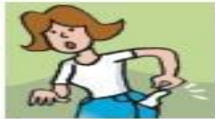
I can't buy new shoes. (impossible - present)