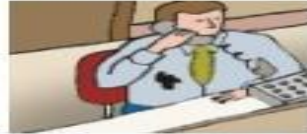
He couldn't visit us. (impossible - past)