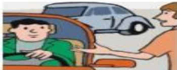
Can (informal)/ could (polite) you take me to the club? (favor)