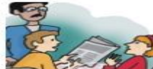
We could have a pizza. (suggestion)