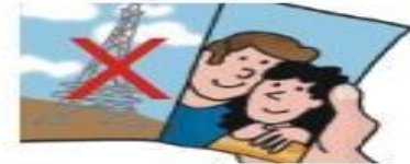
They can't be in London. (impossible)