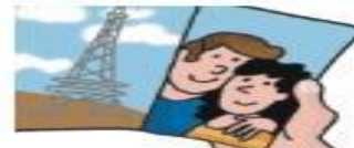
They must be in Paris. (no other possibility)