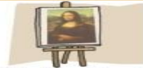
Da Vinci could paint well. (ability, past)