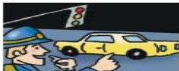
You must stop at the red light. (obligation)