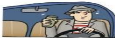
You mustn't drink and drive. (prohibition)