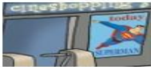
Superman can fly. (ability, affirmative)

Modal verbs express the speaker's attitude to the action indicated by the main verb.