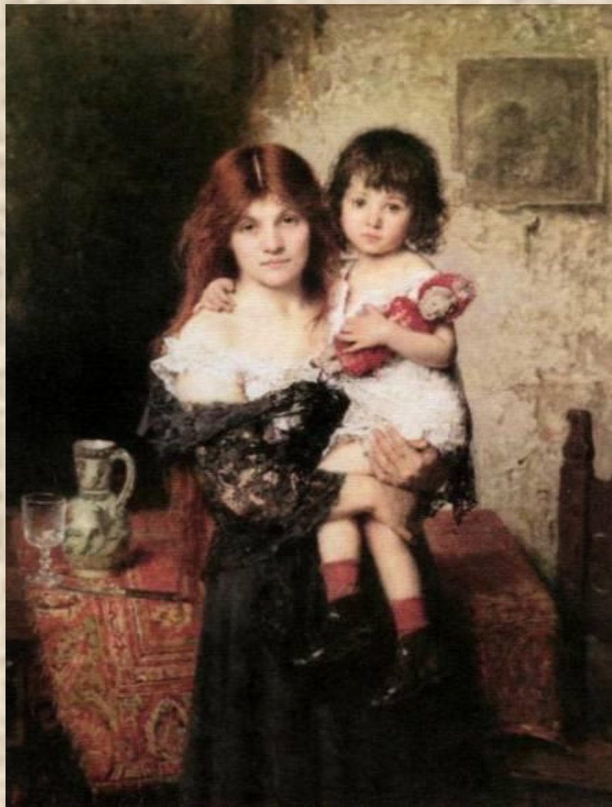
Мать и дочь.