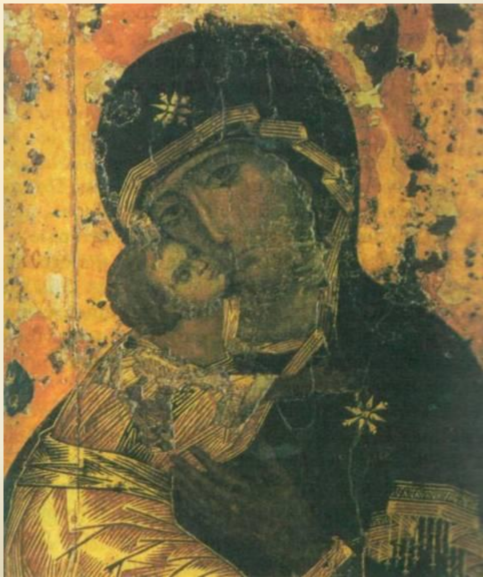
Владимирская икона Божией Матери.