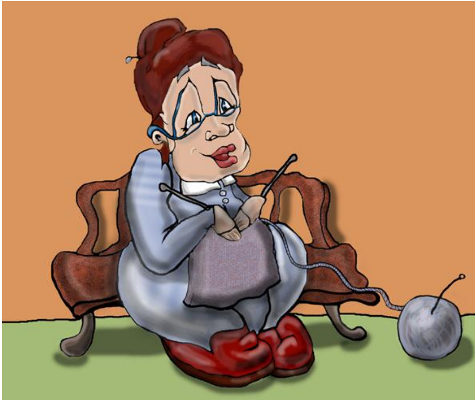
I have a grandmother