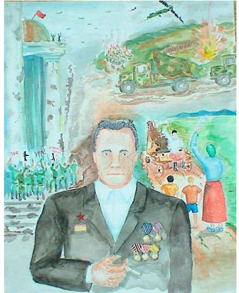
I have a grandfather