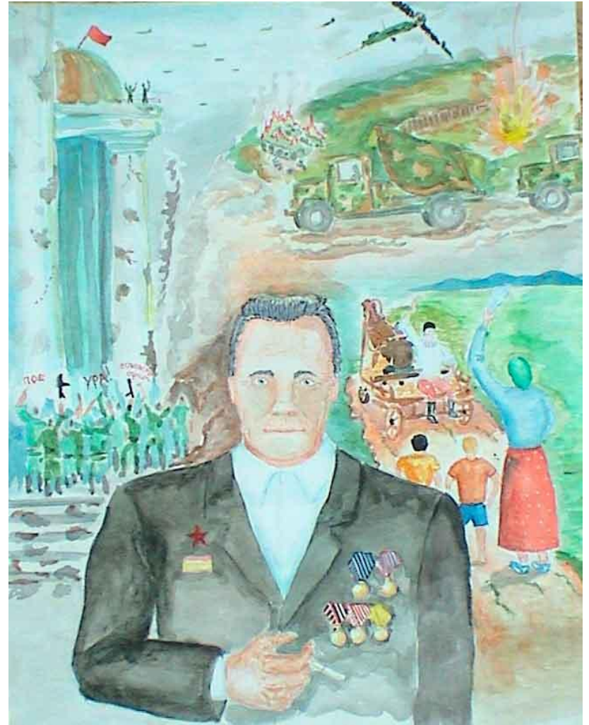
I have a grandfather