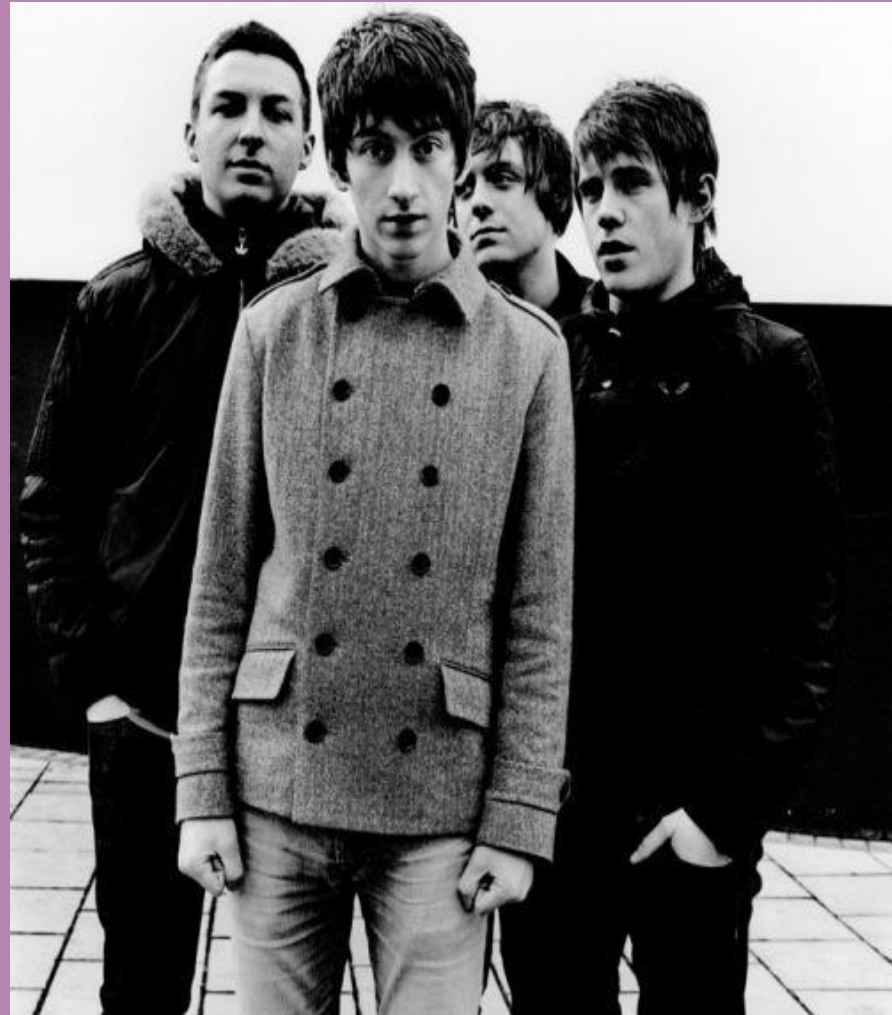
Famous indie-rock band “Arctic Monkeys”

Indie rock has been identified as a reaction against the "macho" culture that developed in alternative rock.