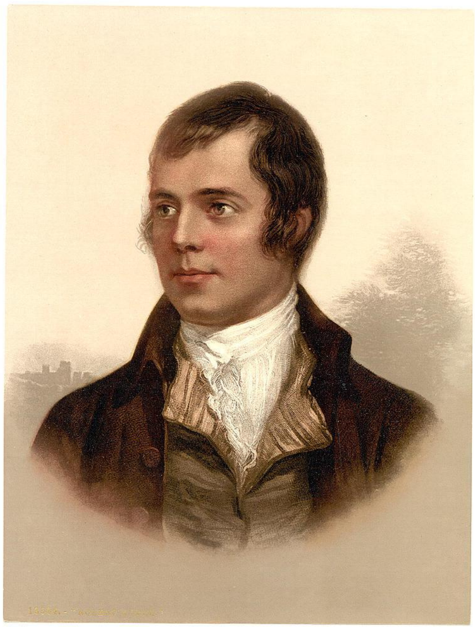
1788 - James Watt

-His poems expressed his love of the country and its people