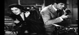
What my mother thinks I do