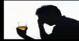
What my friends think I do