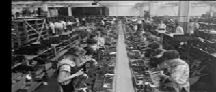
What I really do

So journalists can influence the history. That is why I want to be a journalist.