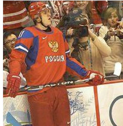
Evgeny Malkin at the 2010 Winter Olympics in the match against Latvia.

At the Youth World Championships 2005 and 2006 he wins the silver medal