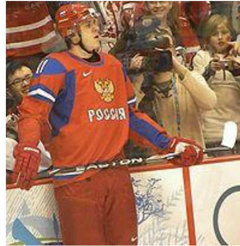
Evgeny Malkin at the 2010 Winter Olympics in the match against Latvia.

At the Youth World Championships 2005 and 2006 he wins the silver medal