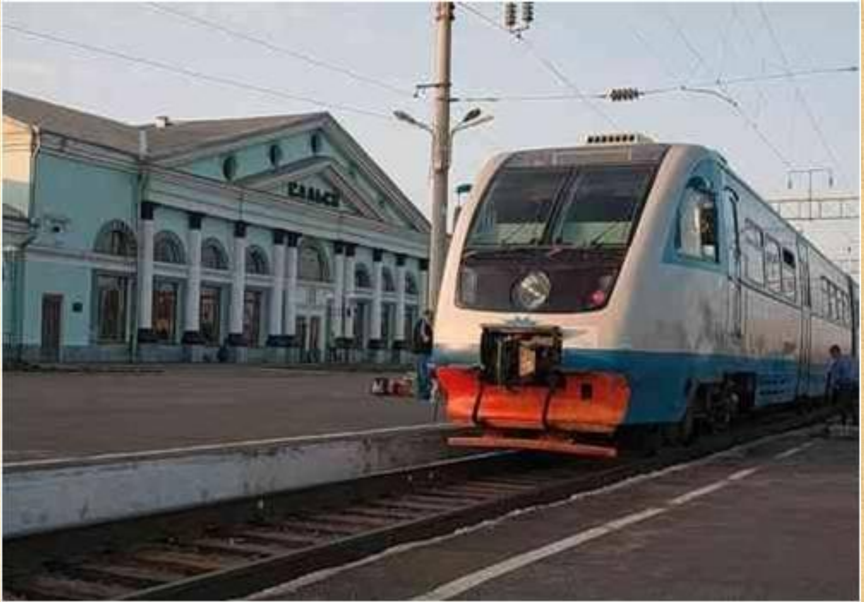
A big railway station