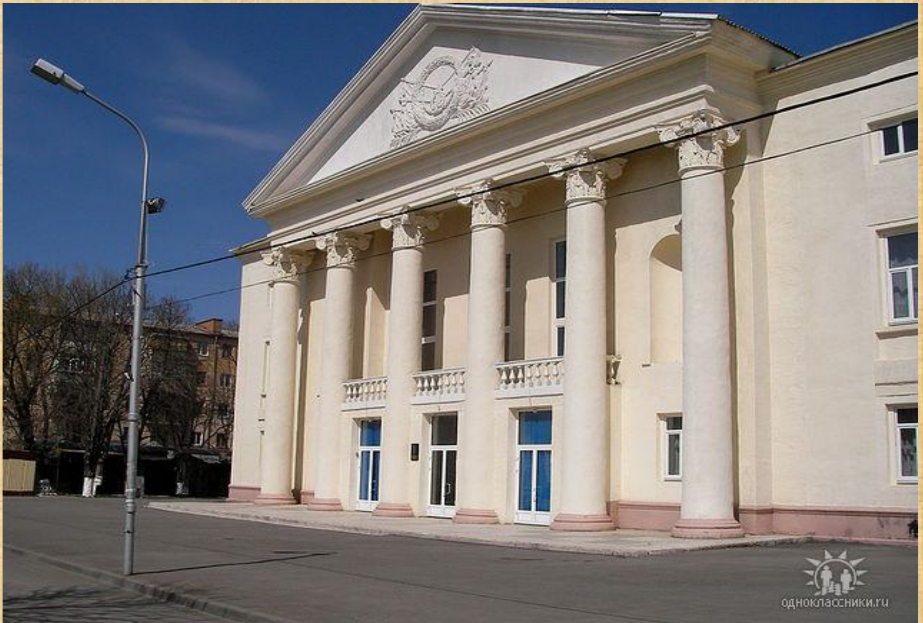
Salsk Palace of Culture