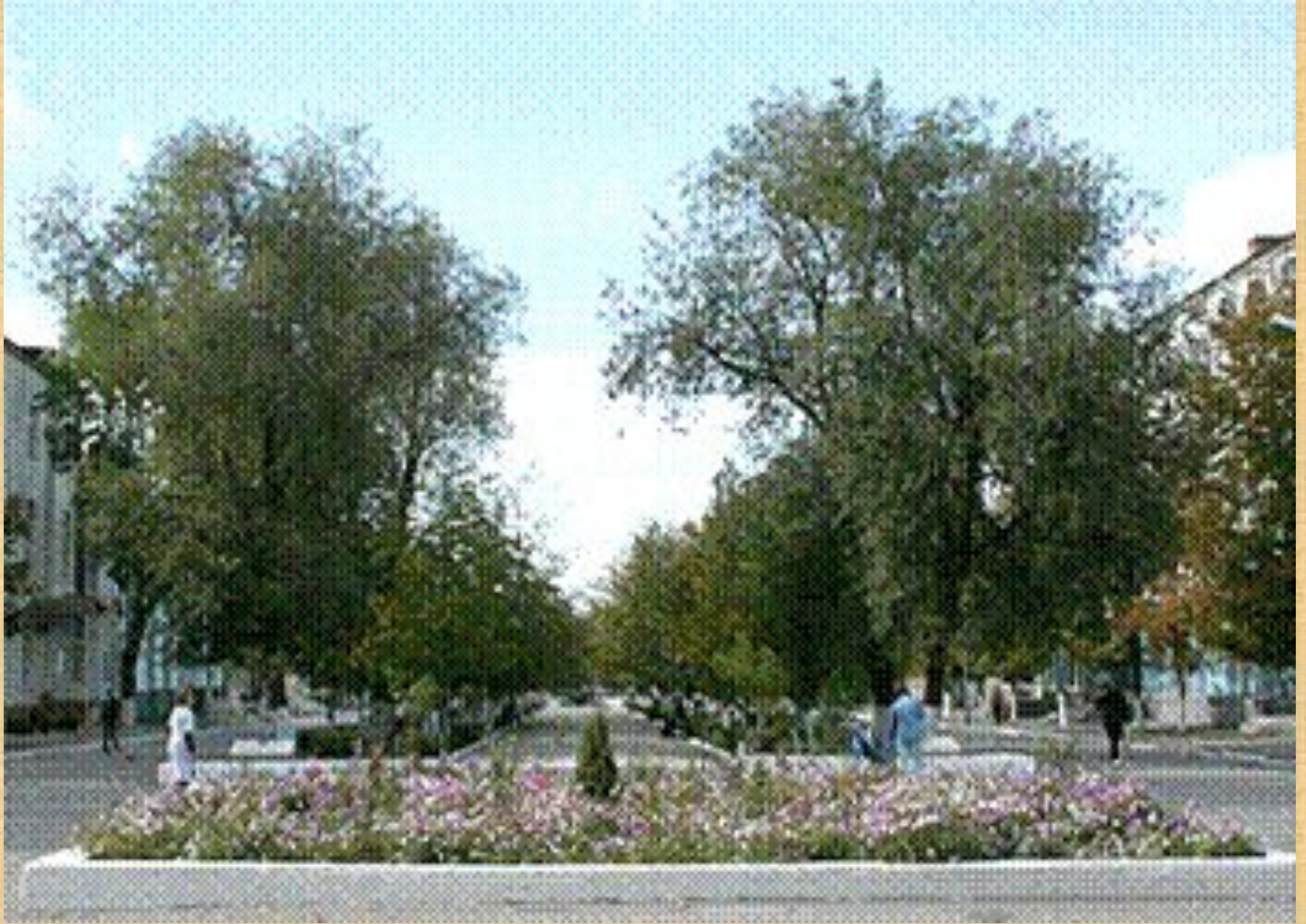
Lenin Street is the central street of our town