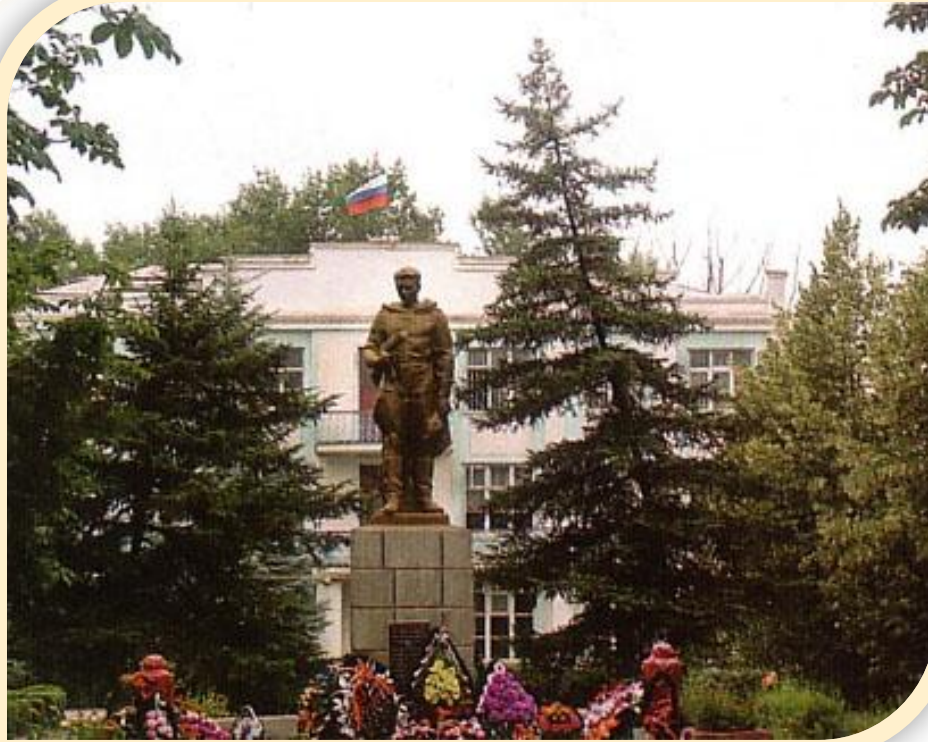
The Monument to the Unknown Soldier.

A lot of people come here to honour and remember in the peaceful times the fallen heroes, to know and understand the past and the future