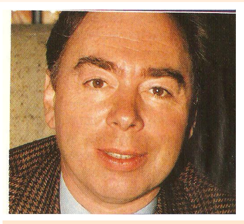
is the king of the musical today. His musicals and rock operas have been a great success both in Britain and overseas.