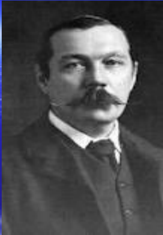
Sir Arthur Conan Doyle