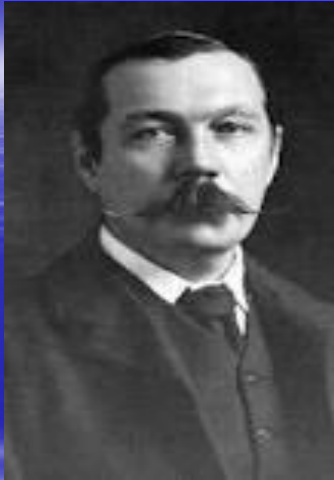
Sir Arthur Conan Doyle