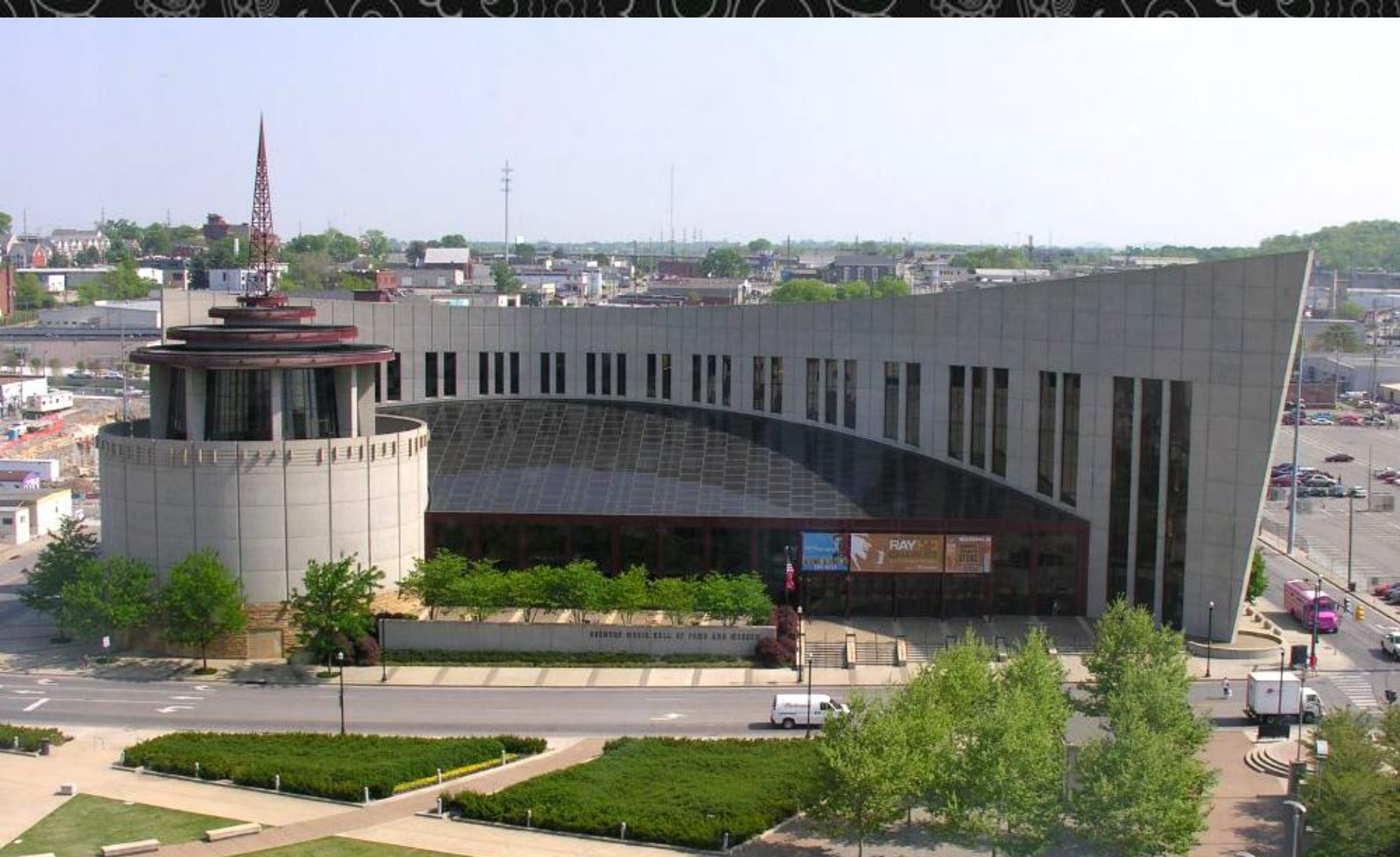
Country Music Hall of Fame and Museum