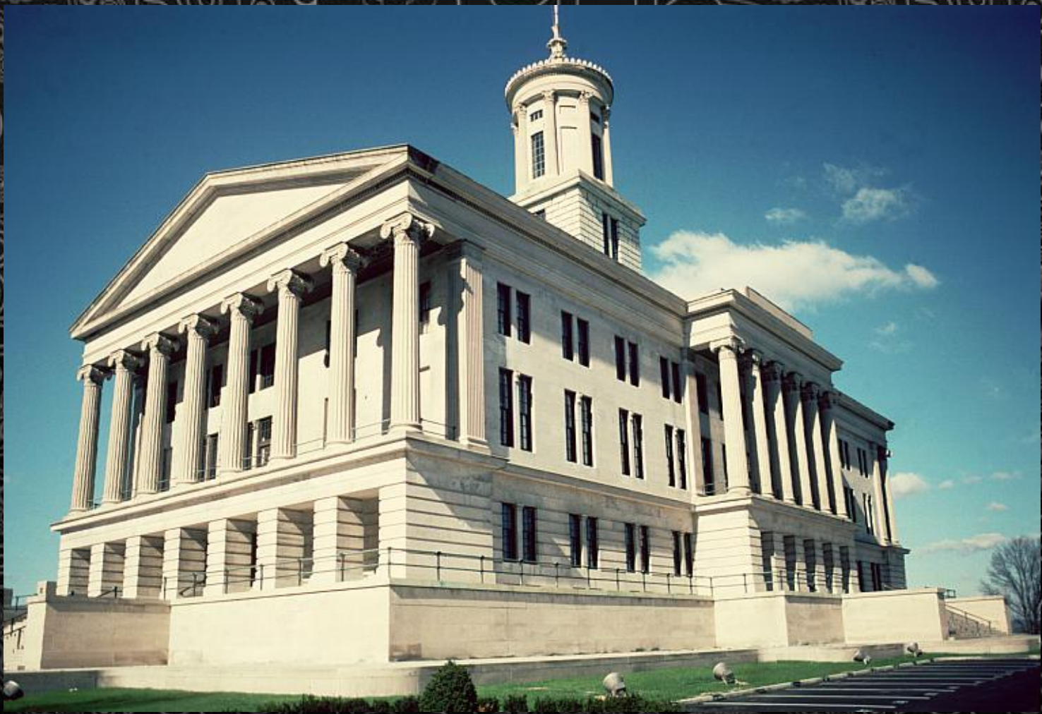
Tennessee State Capitol