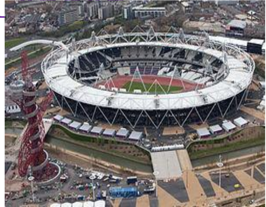
“ Olympic stadium”