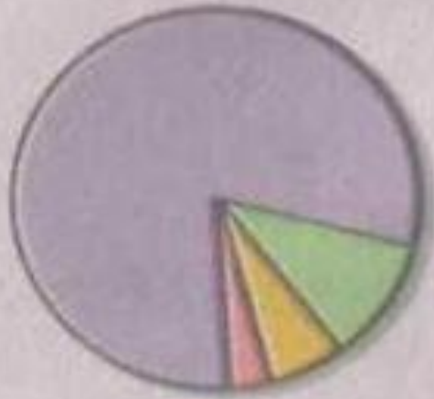
UK population diagram