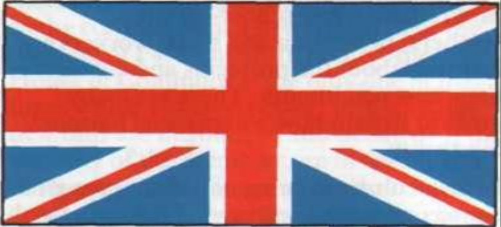
The Union Jack