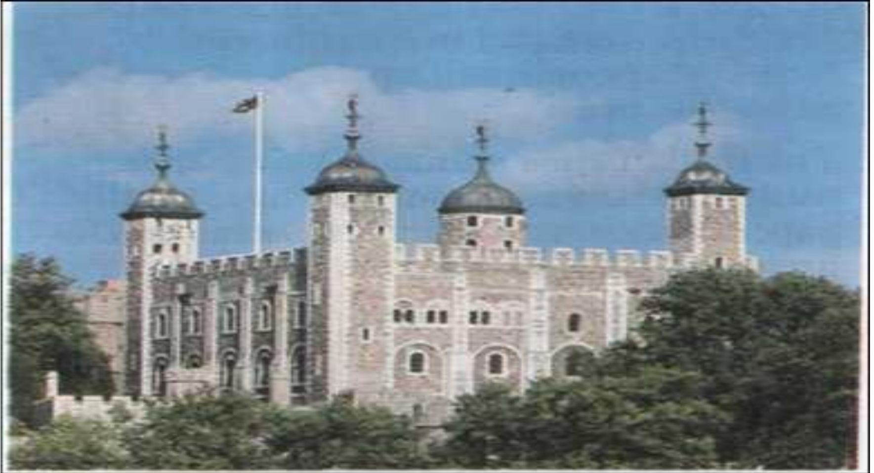
The Tower of London