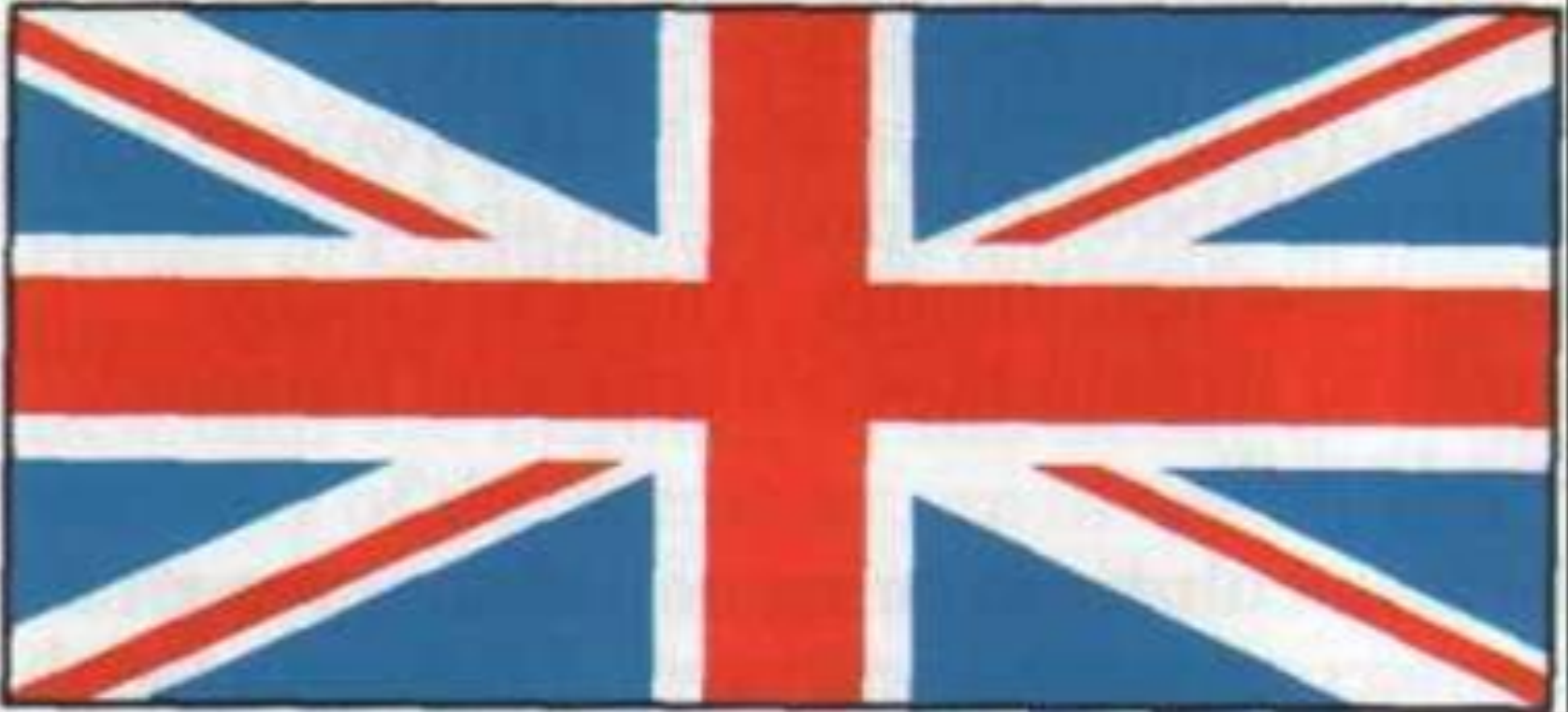
The Union Jack