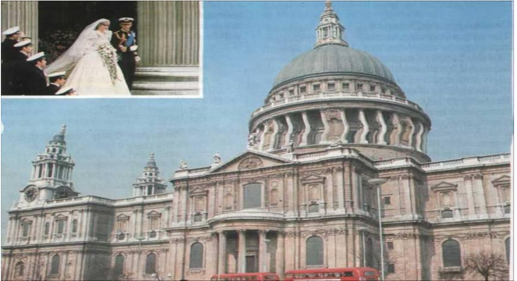
St. Paul`s Cathedral