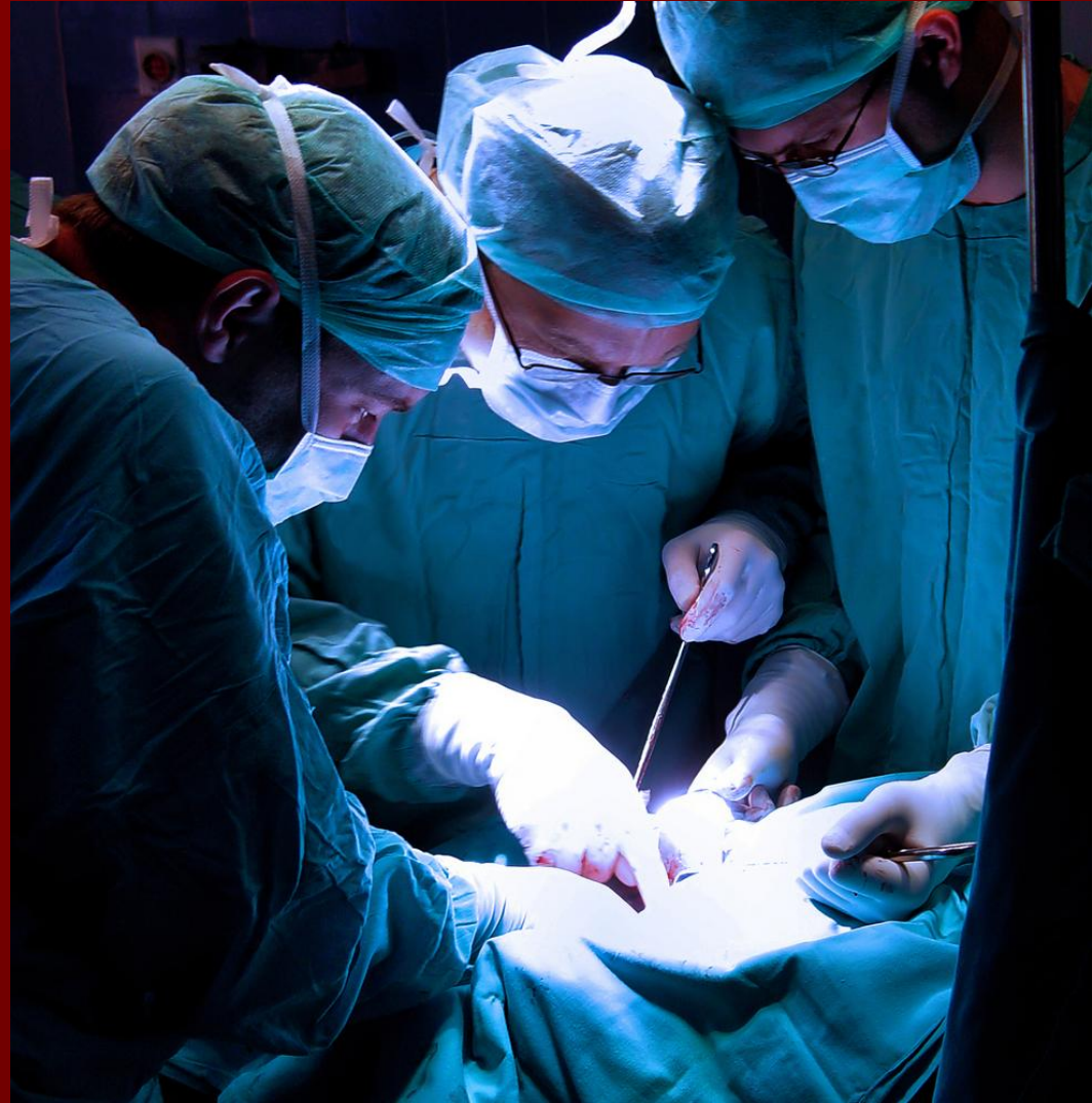
(surgery on the brain)

A neurosurgeon is a surgeon who specializes in operating on the brain, head, neck, and spinal cord.