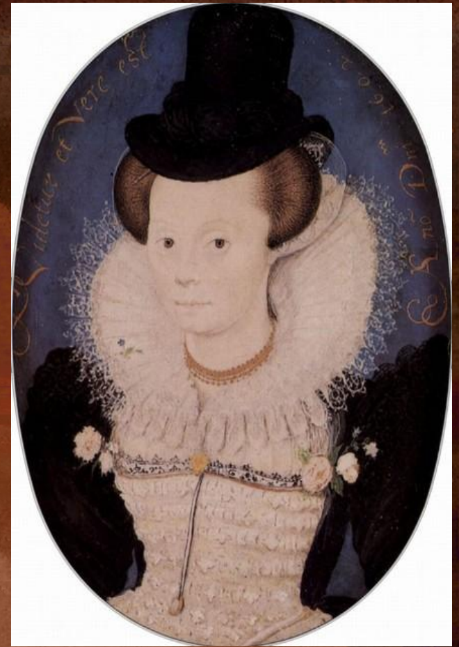
Portrait of the unknown person, 1602, London, Victoria and Albert's museum

The subtlety of performance of Hilliard's works admires. He was able to reproduce thin laces of a collar or a shining jewel.