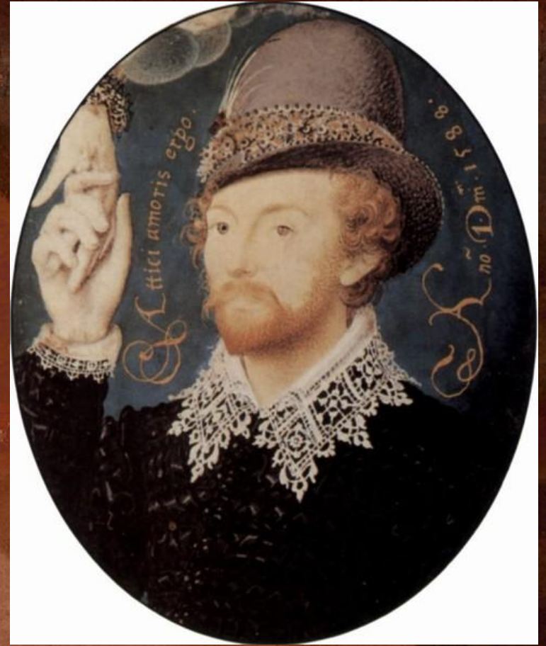
Portrait of the unknown person holding a female hand, 1588, London, National gallery of England

The artist painted portraits on small pieces of paper or parchment. In his works he used gentle tones of water colours that gave special tenderness and grace to his miniatures.