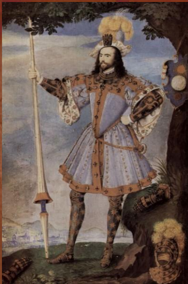
George Klifford's portrait, the column of Cumberland, nearby 1590, London, a national sea museum

Nicholas Hilliard was an English goldsmith and a limner best known for his portrait miniatures of members of the courts of Elizabeth I and James I of England. He mostly painted small oval miniatures, but also some larger cabinet miniatures, up to about ten inches tall, and at least two famous half-length panel portraits of Elizabeth.