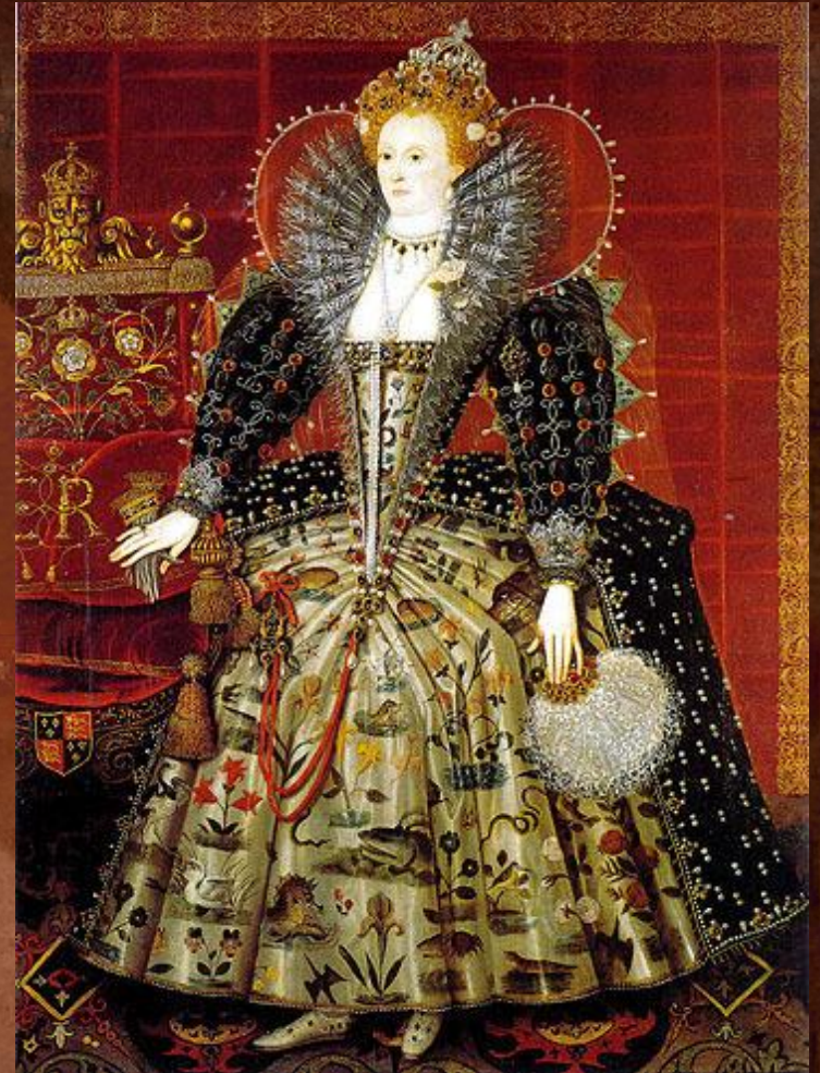
Nicholas Hilliard's workshop, queen Elizabeth I (a portrait in Herdvice, 1599)

Nicholas Hilliard was the court miniature painter of queen Elizabeth.