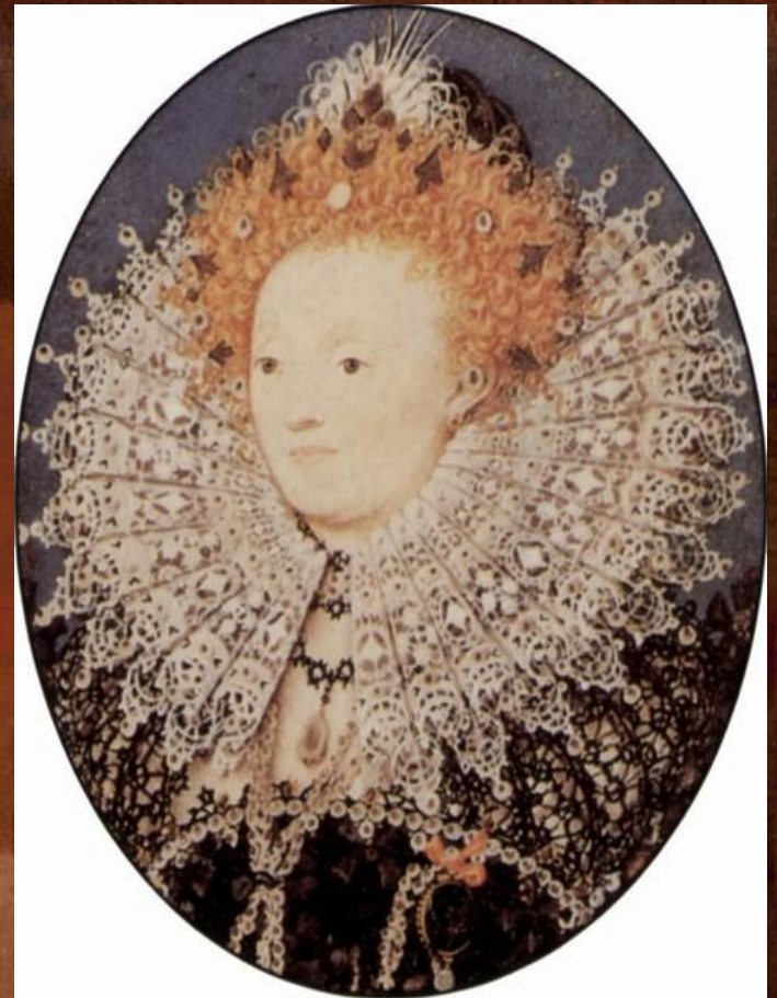
Portrait of English queen Elizabeth I, 1587, London, National portrait gallery

Magnificent hairdresses of ladies are covered by gold ornaments, magnificent suits are decorated and sparkle as if strange plumage of paradise birds. And even Shakespeare in the masterpieces appreciated Nicolas Hilliard's creativity.