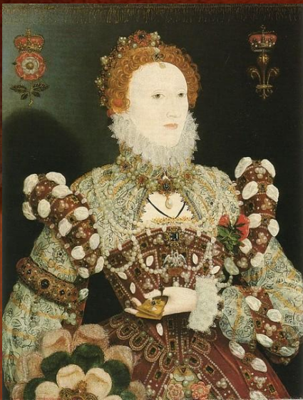
Portrait of English queen Elizabeth I, nearby 1590, Walker Art Gallery, Liverpool