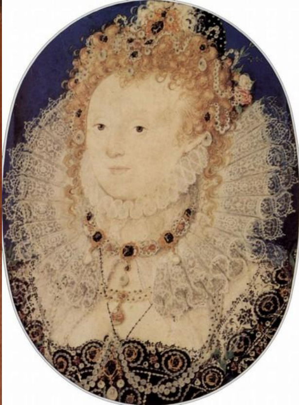
Portrait of English queen Elizabeth I, nearby 1590, Victoria and Albert's London museum

Technically he was very conservative according to European standards, but his paintings are superbly executed and have freshness and charm that has ensured his continuing reputation as "the central artistic figure of the Elizabethian age, the only English painter whose work reflects, in its delicate microcosm, the world of Shakespeare's earlier plays".