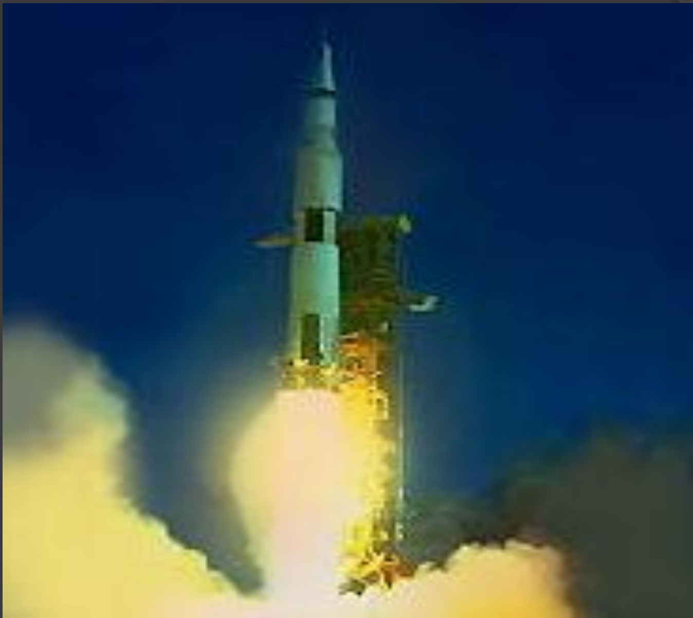
Start of a spaceship "Apollo".