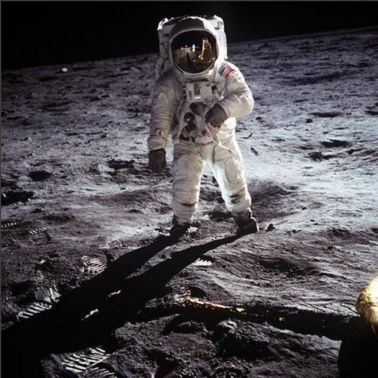
Armstrong on the moon