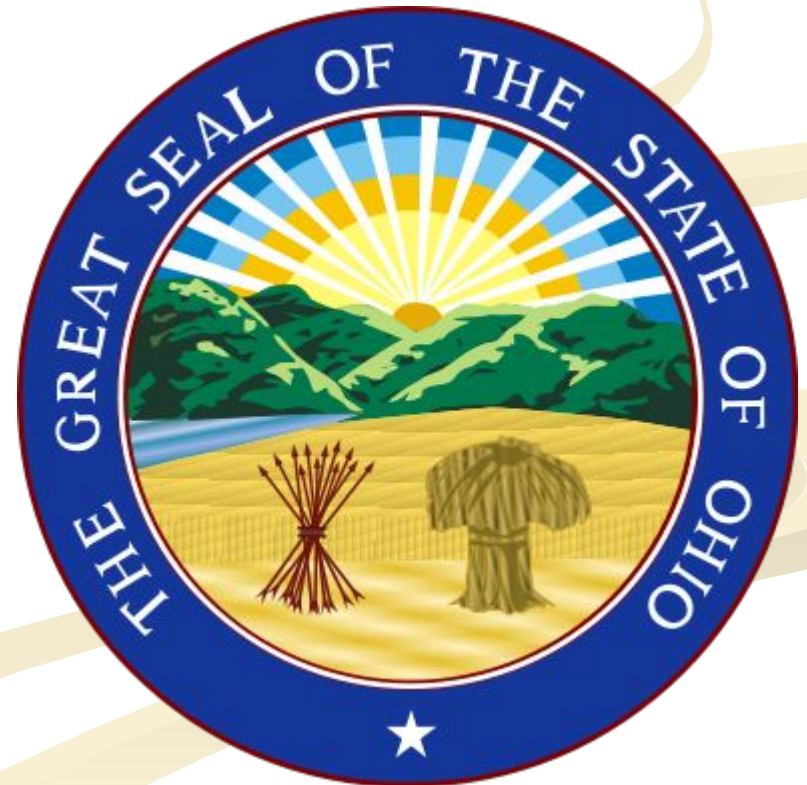
Seal of Ohio