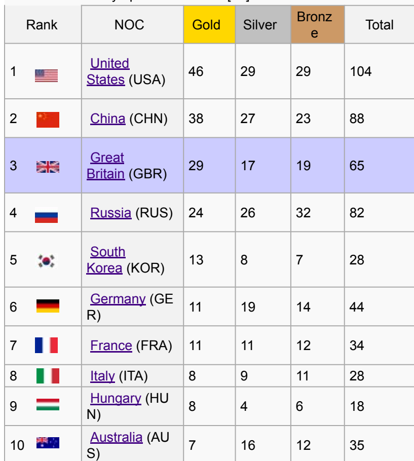
2012 Summer Olympics medal table[15]