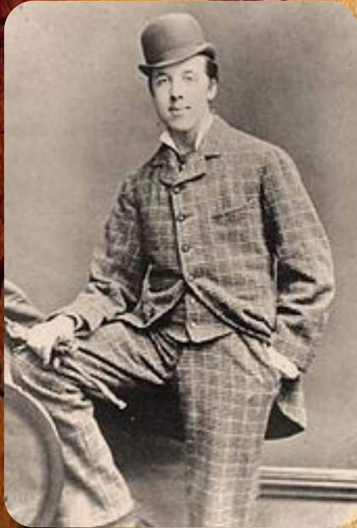
Oscar Wilde at Oxford