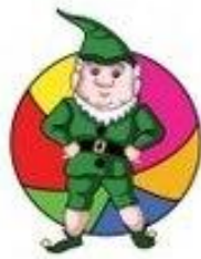
in front of