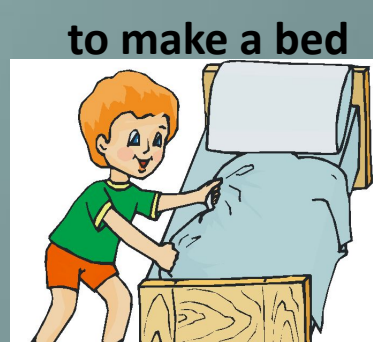
to make a bed