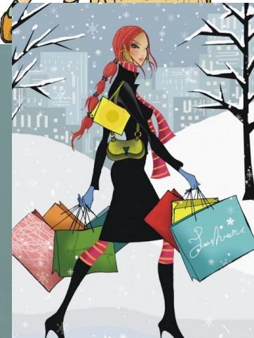
to go shopping