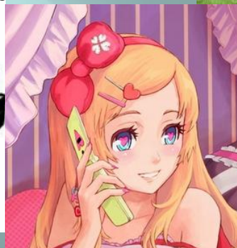
to answer the phone