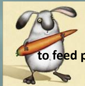
to feed pets