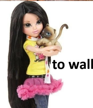
to walk the