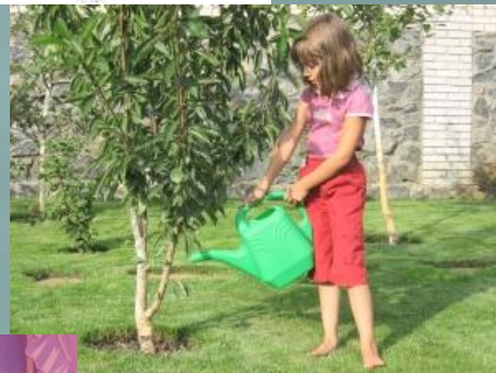
to water the trees