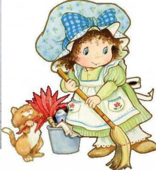
to sweep the floor