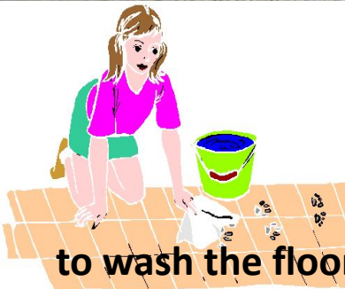
to wash the floor