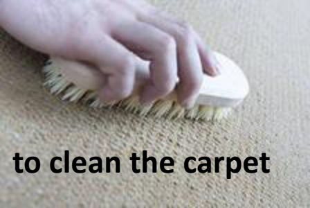
to clean the carpet