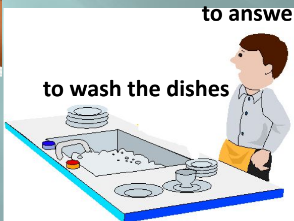
to wash the dishes