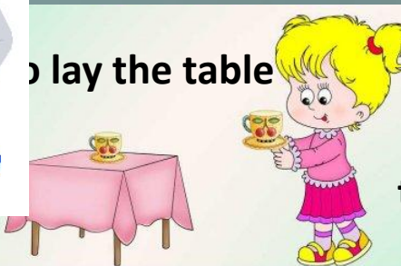
to lay the table