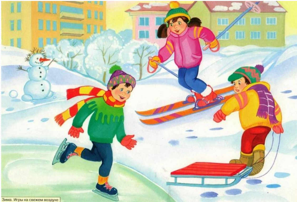
Зима. Игры на свежем воздухе