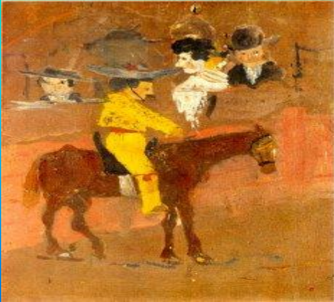
Picasso's first painting at age 8, Picador (1889).