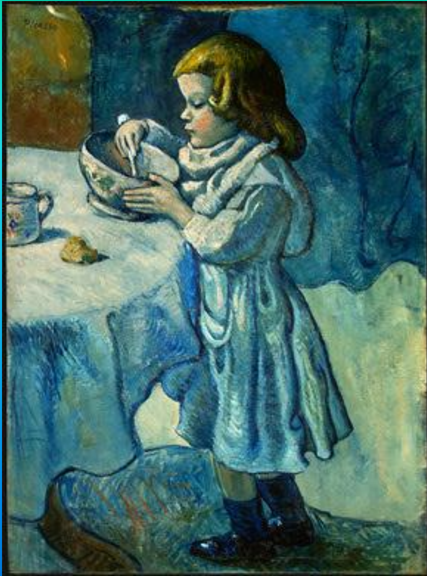
“Le Gourmet” 1901