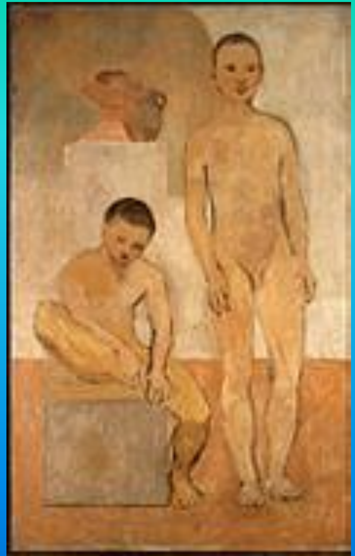
“Two Youths” 1905