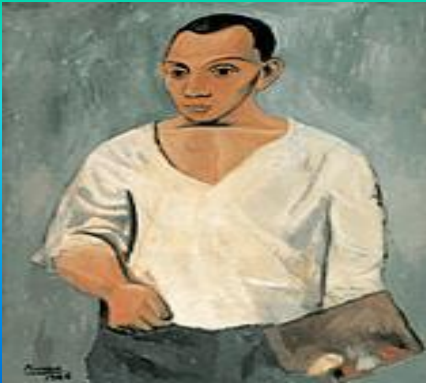
“Self Portrait with Palette” 1906