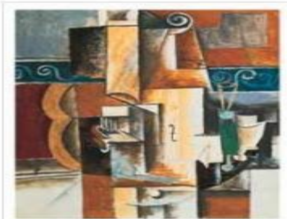
Pablo Picasso Violin & Guitar