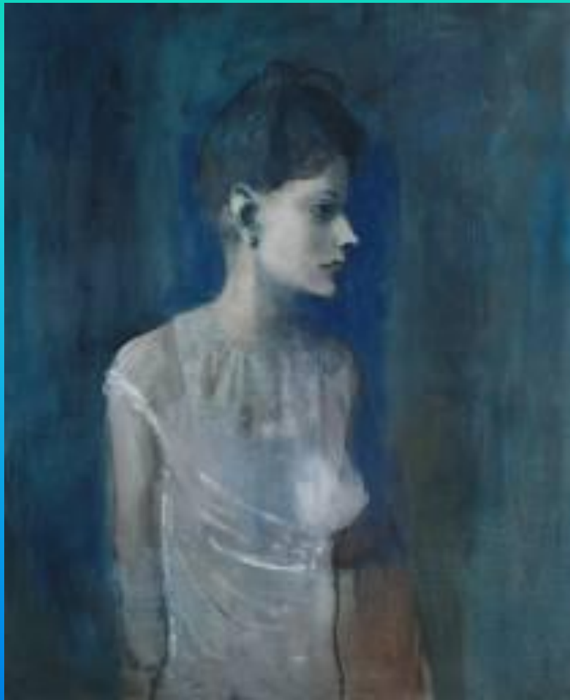
“Girl in Chemise” 1905