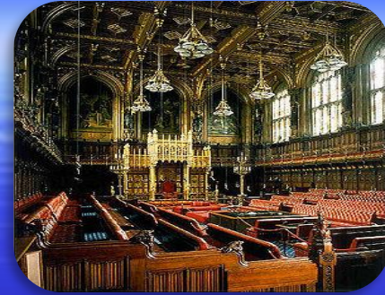
the House of Lords

about 650 elected MPs- makes laws; discusses political Problems