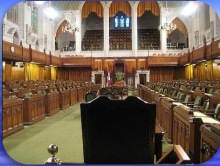
the House of Commons

about 650 elected MPs- makes laws; discusses political Problems