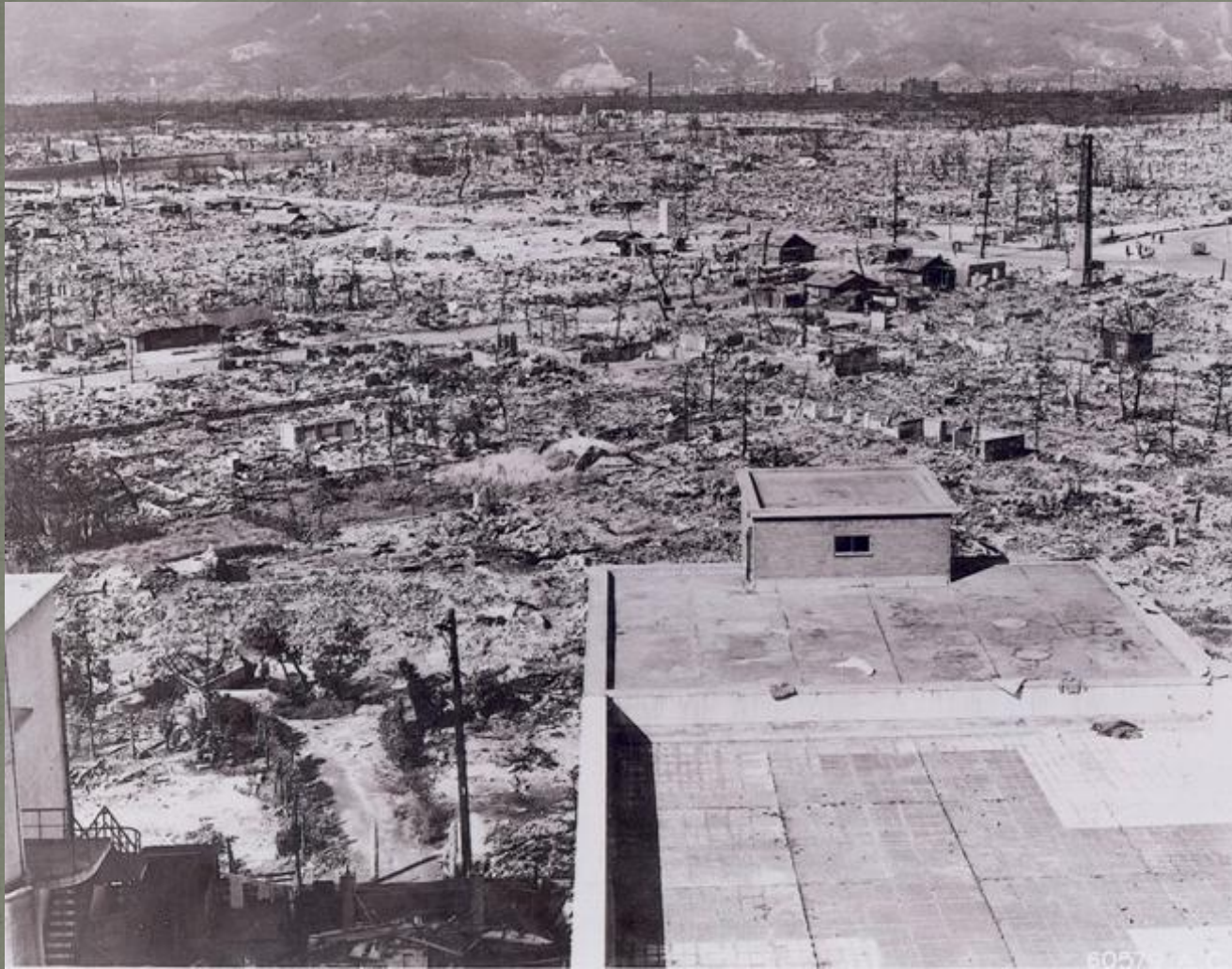
On the 6 th of August US dropped atomic bomb on Hiroshima