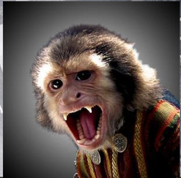
Jack the Monkey