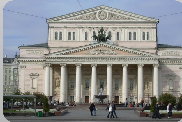
The Bolshoi Theater