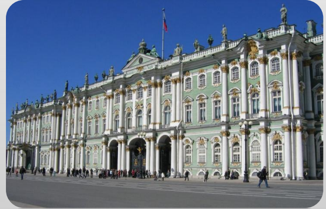
The State Hermitage Museum