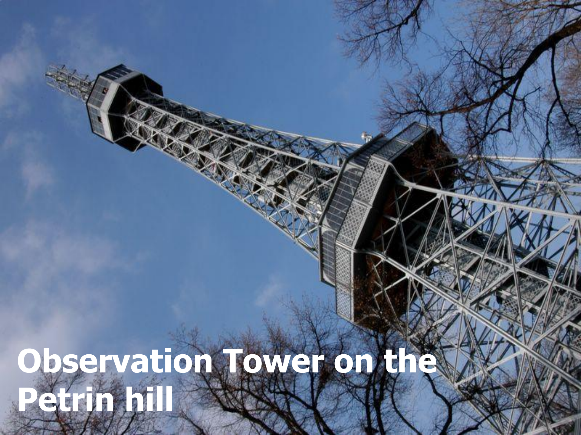
Observation Tower on the Petrin hill