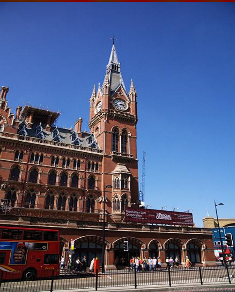
● St. Pancras Station