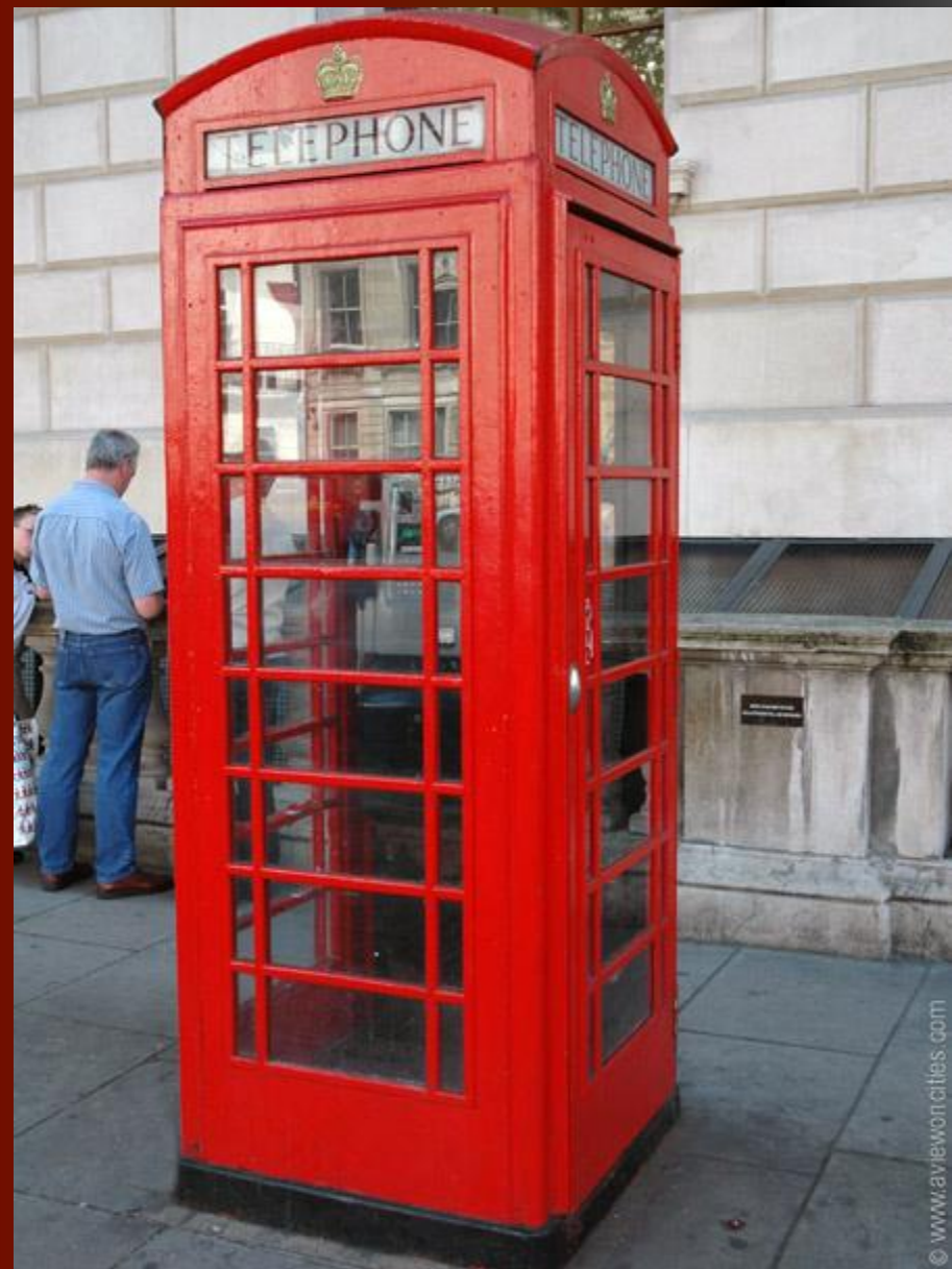
London Telephone Booth