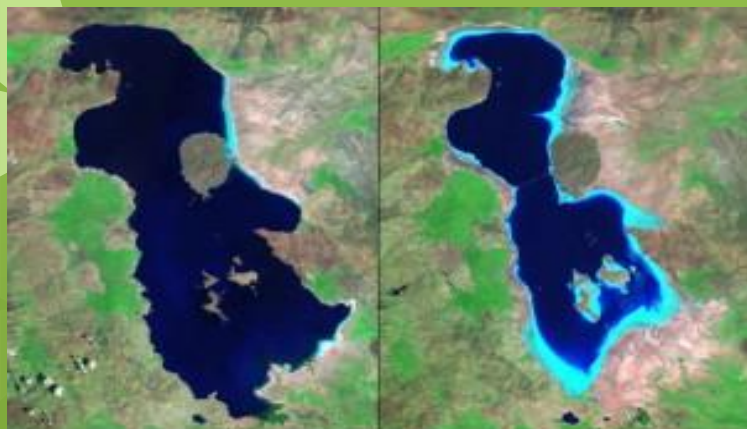
Lake Urmia. Left: 1985. Right: August 2010.

Vast forests are cut and burn in fire. Their disappearance upsets the oxygen balance. As a result some rare species of animals, birds, fish and plants disappear forever, a number of rivers and lakes dry up.