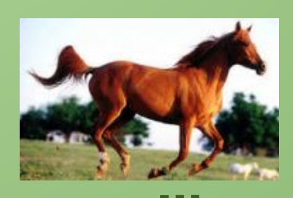
run like a horse