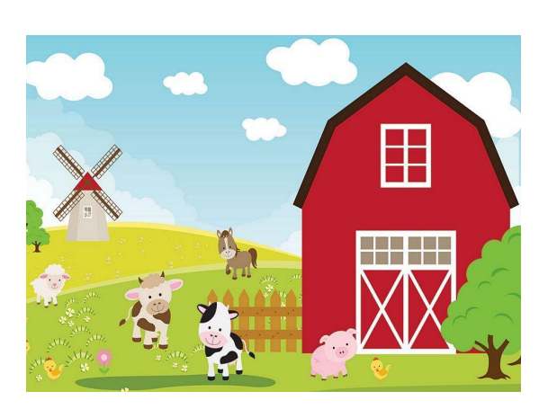
on the farm