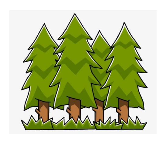
in the forest