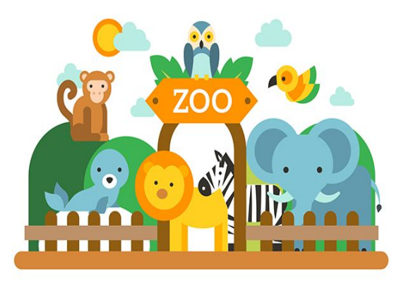
in the zoo