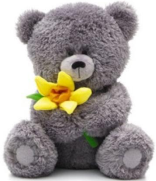
Teddy bear [tedi beə]