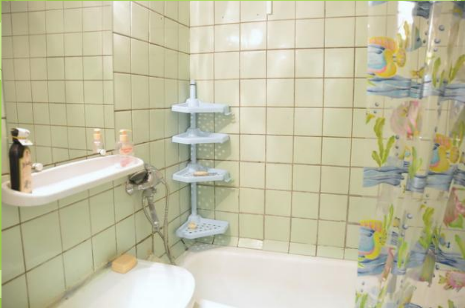
A bathroom with a bath, a shower and a mirror.