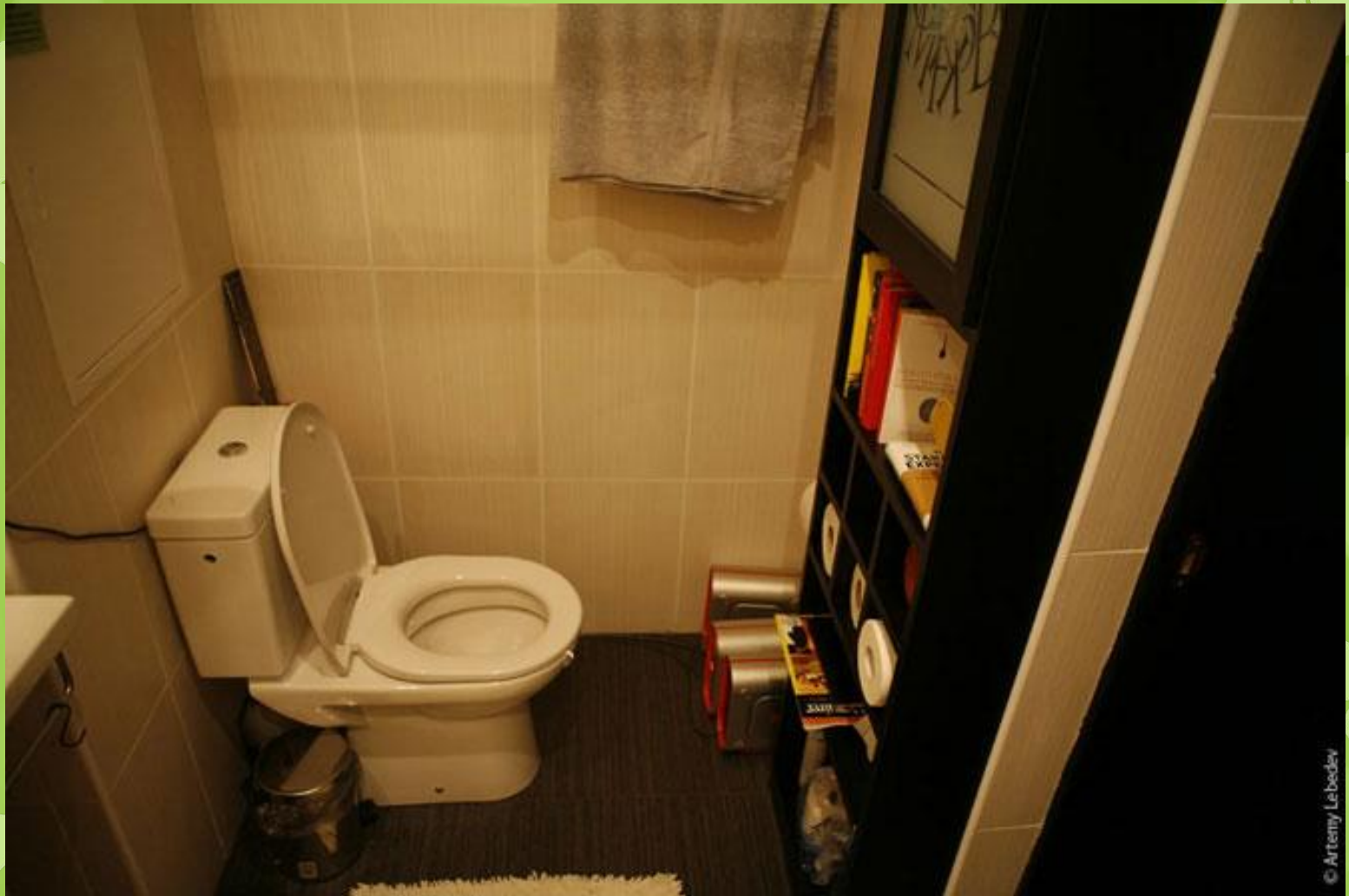
A lavatory with a toilet bowl, a washbasin and a shelf for toilet paper.