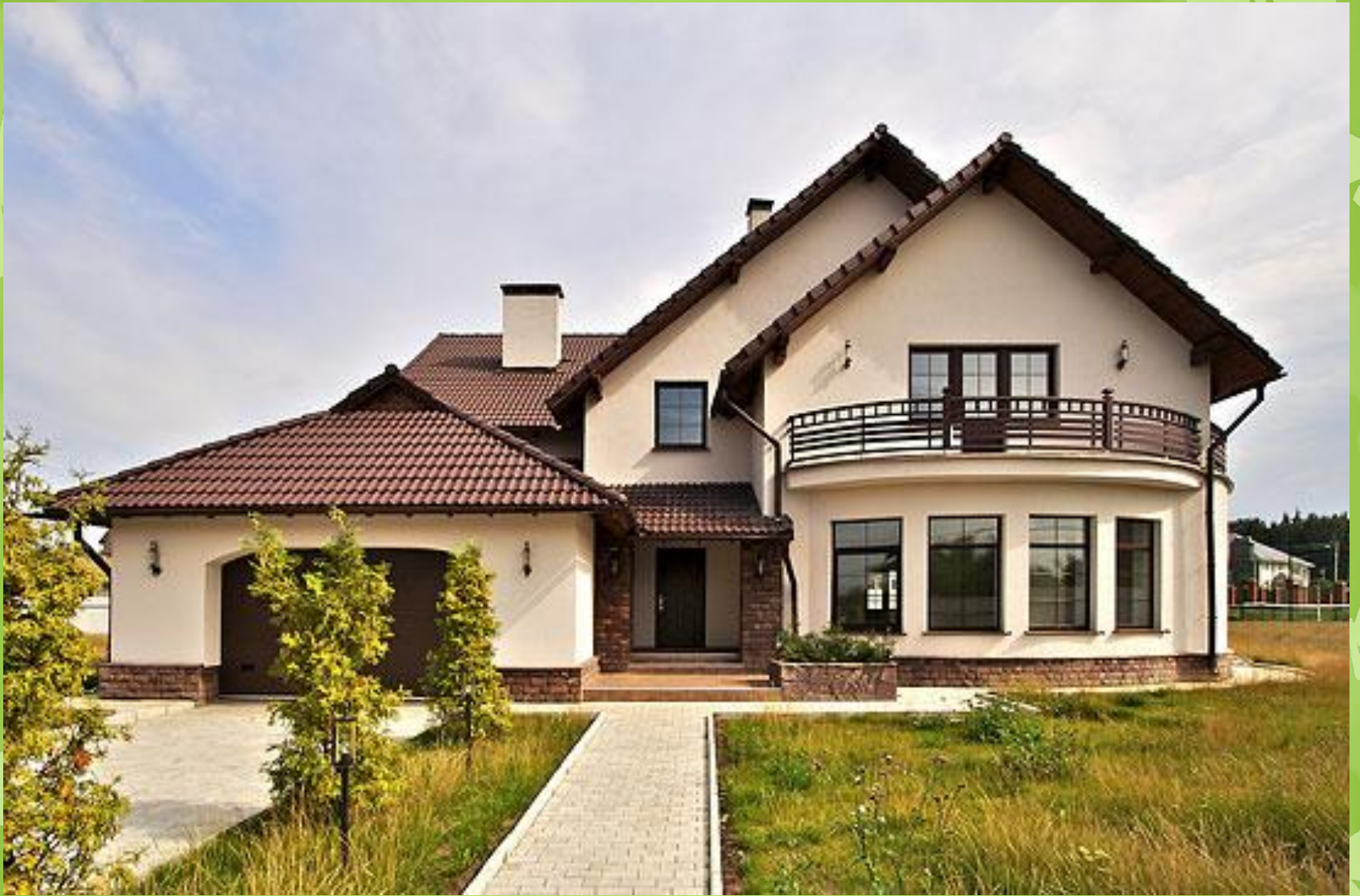
a large cottage...