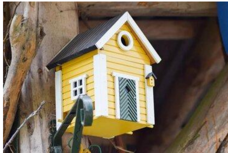
a bird house