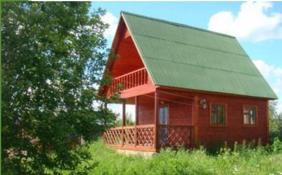
a country house