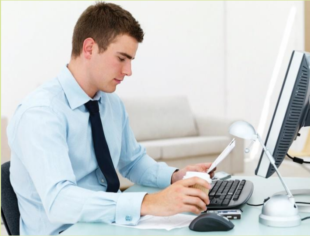
Men wear trousers and shirts at work