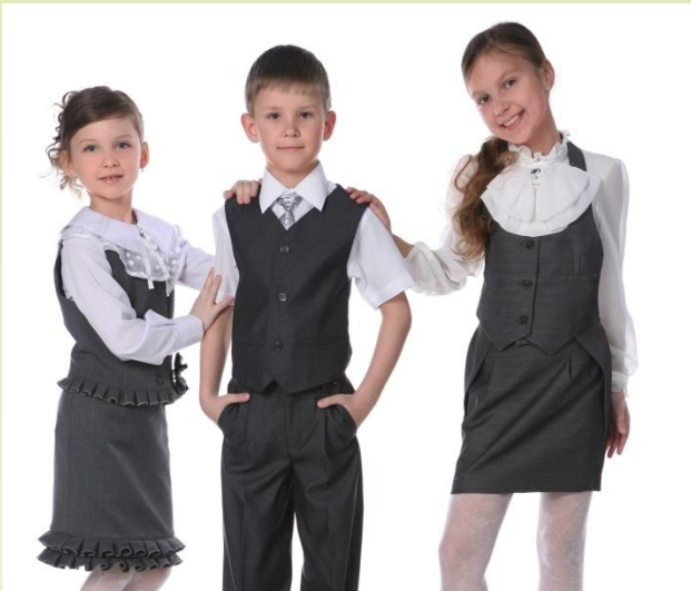
Pupils don't like to wear school uniform