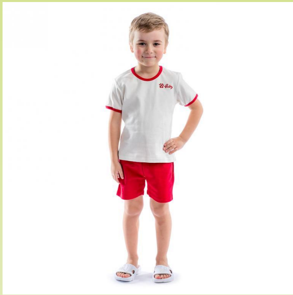
Children have on shorts and T-shirts in summer