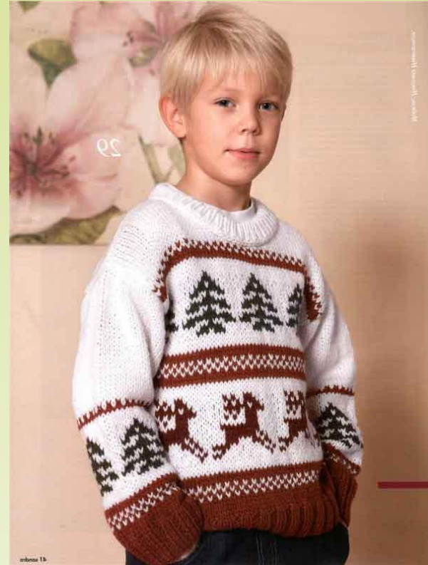
We put on sweaters when it is cold