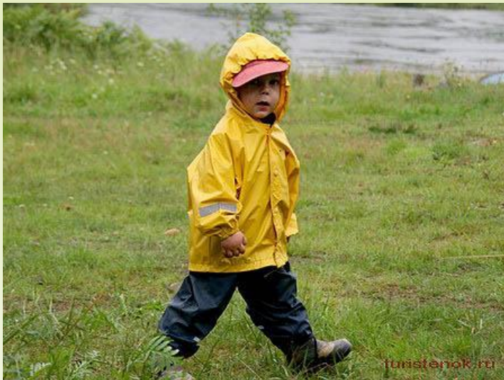
We put on raincoats when it is rainy