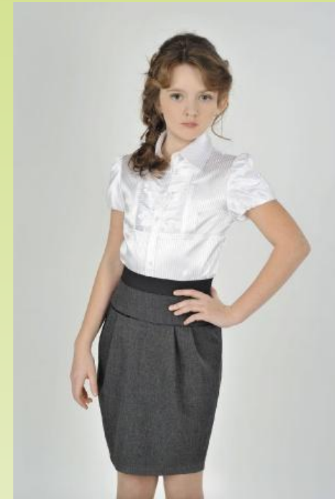
Girls wear skirts and blouses