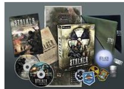
A computer game