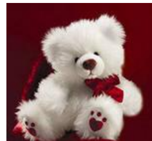
A teddy bear