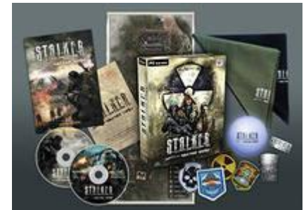
A computer game