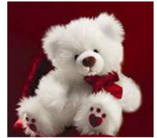
A teddy bear