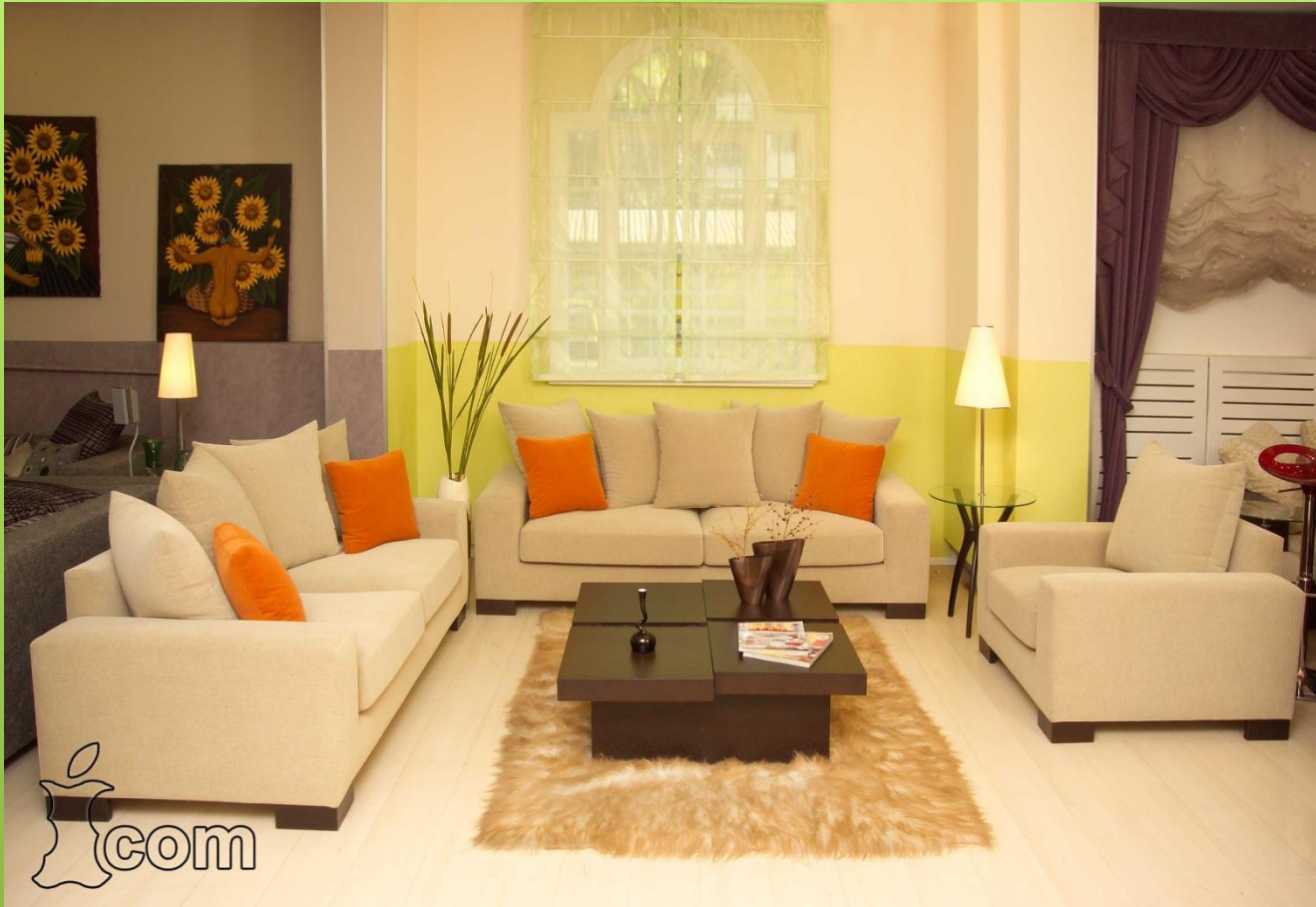
A living room