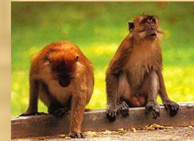
a mon key