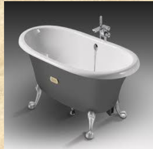
It is a bath.