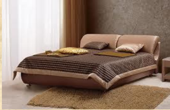
It is a bed.