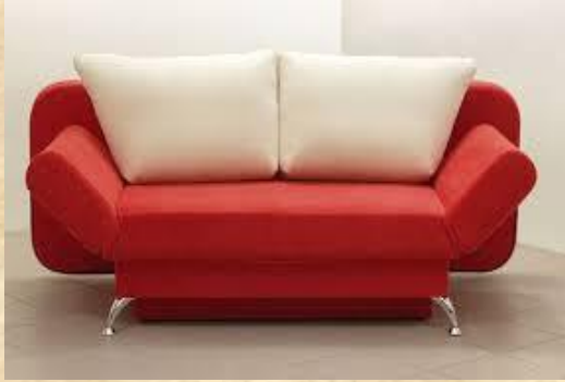
It is a sofa.