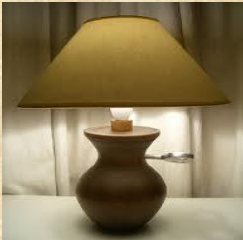
It is a lamp.