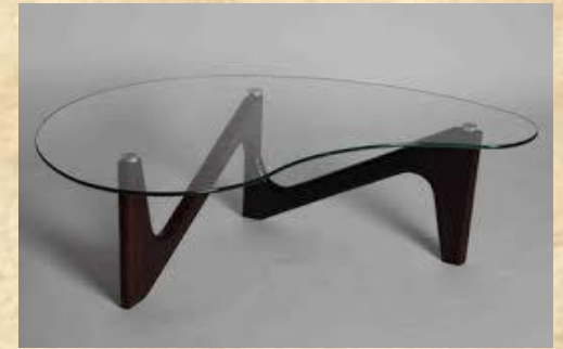
a coffee table