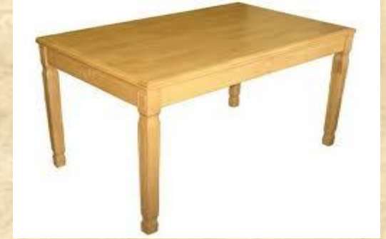
It is a table.