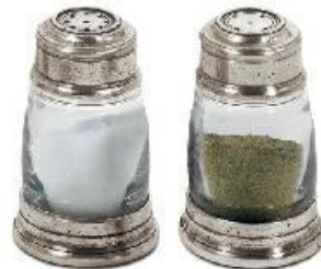
salt and pepper