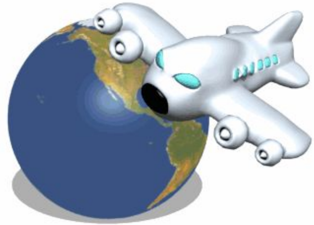
Tom's plane Tom