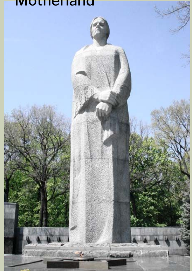
Monument to Motherland