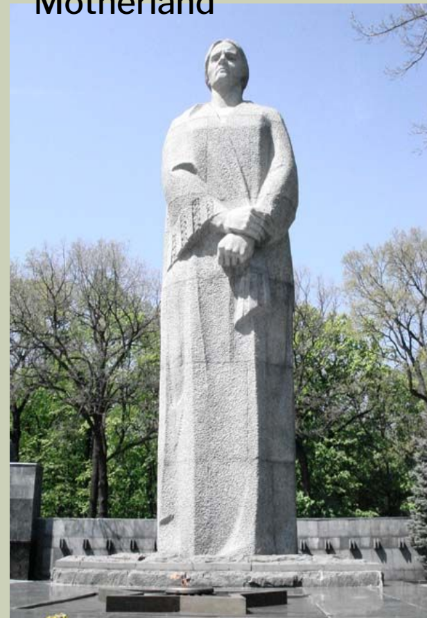
Monument to Motherland