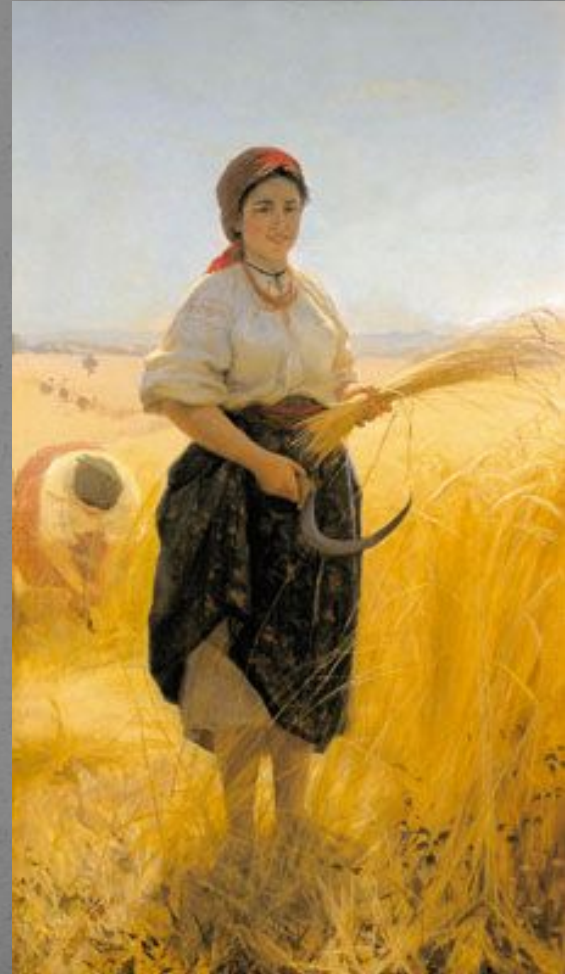
Harvester, Oil on canvas. 1889, National Art Museum of Ukraine, Kiev