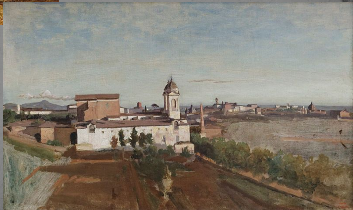
Bornova, İzmir, 1873