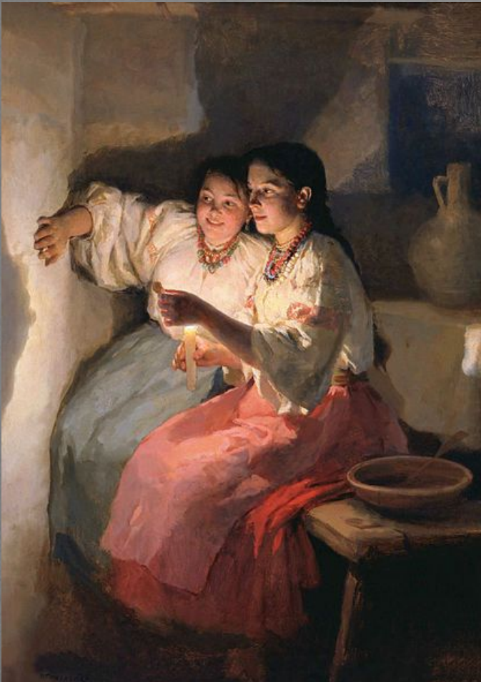
Mykola Pymonenko. Fortune-Telling on Christmastide. 1888. The State Russian Museum, Saint Petersburg

was a Ukrainian painter. One of the most eminent Ukrainian genre painters Pymonenko was widely acclaimed in the Russian Empire; A member of the Imperial Academy of Arts since 1904 and of a progressive Peredvizhniki artistic movement and the turn of the century.