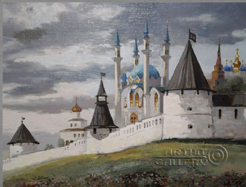
Kazan Kremlin. View of the Kul-Sharif Mosque