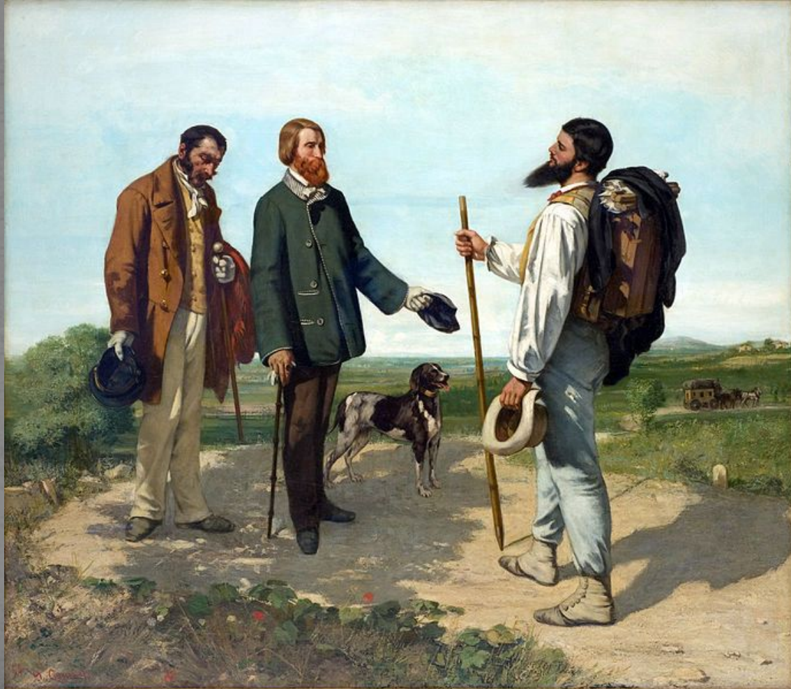
Bonjour, Monsieur Courbet, 1854. A Realist painting by Gustave Courbet.