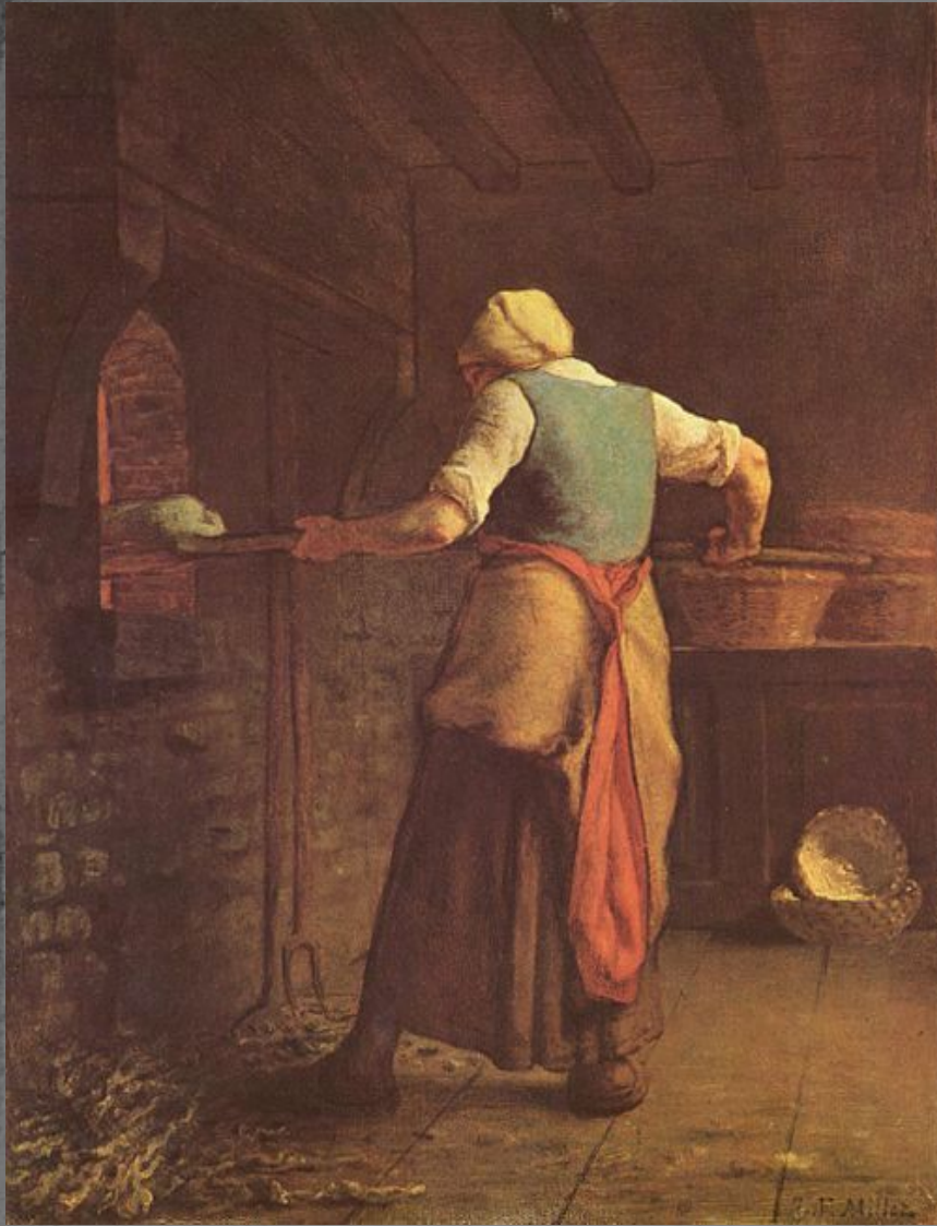
Woman Baking Bread, 1854. Kröller-Müller Museum, Otterlo.