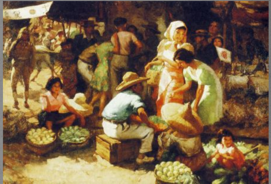
Marketplace during the Occupation (1942), Fernando Cueto Amorsolo, Philippines, Oil on canvas, Collection of National Heritage Board, Singapore

Realism began to move towards images of contemporary life and society 'as they were'.