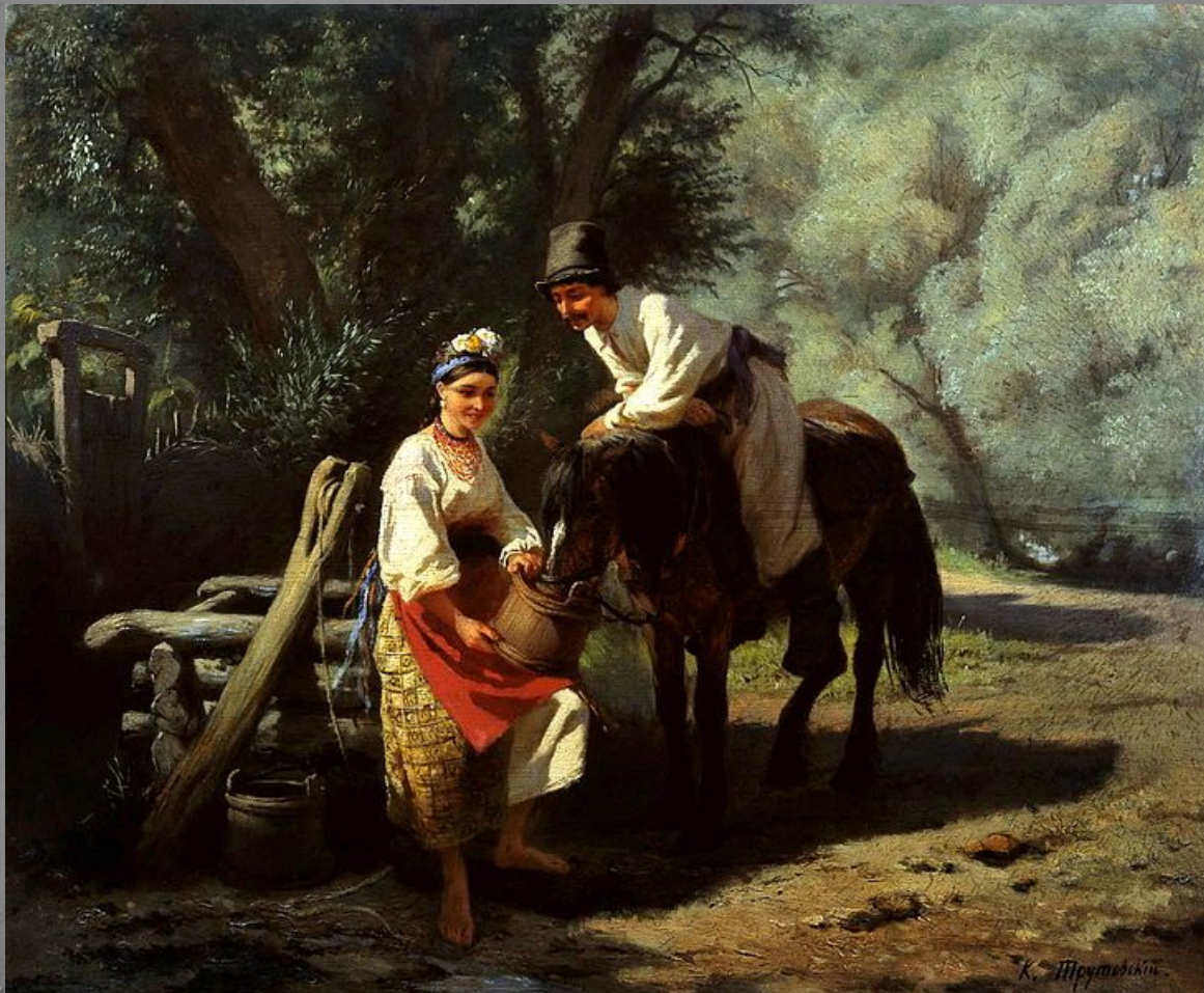
By the water well by Trutovsky

His artistic heritage includes numerous genre screens on Ukrainian themes. He was interested in ethnography and depicted colorful Ukrainian folk customs, not shying away from "a dash of good humour". Like Taras Shevchenko, Ukraine's foremost bard, Trutovsky described the miserable and hopeless life of the peasant.