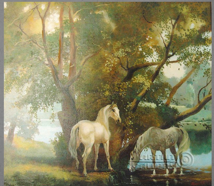
Under the shady willows