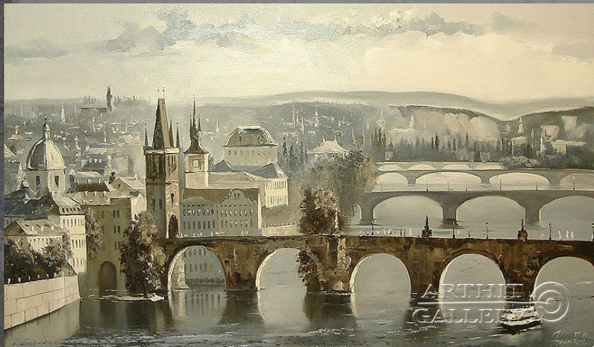
Charles Bridge (Prague)