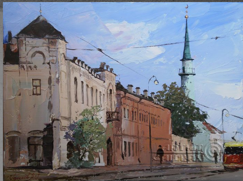
Kazan. Tukaevskaya Street