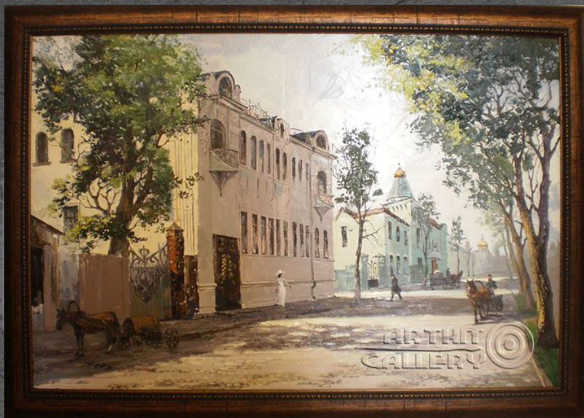
Ufa. Alexandrovskaya Street