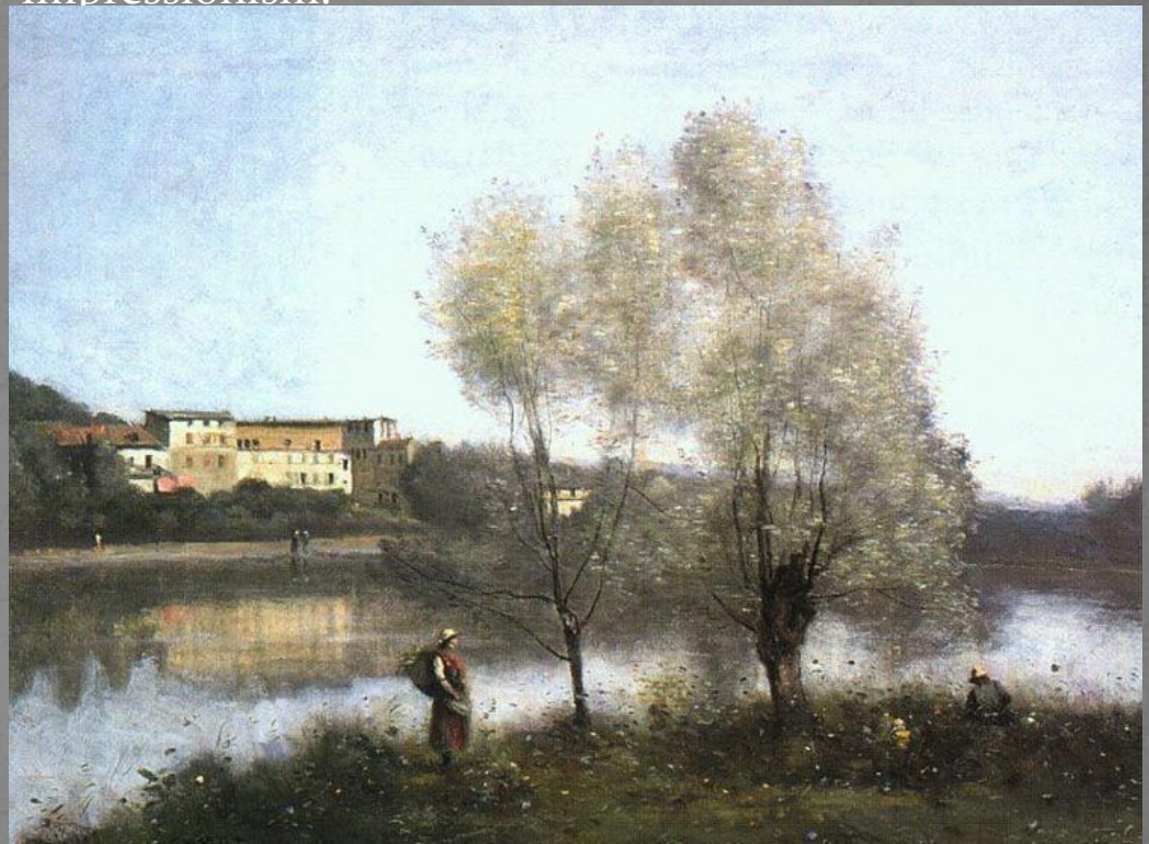
Ville d'Avray, ca. 1867, oil on canvas. Washington, D.C.: National Gallery of Art.