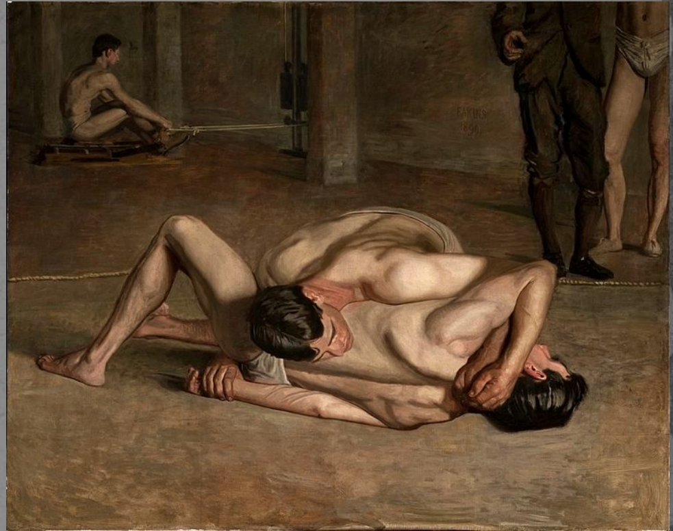
Wrestlers, 1899, Los Angeles County Museum of Art, Los Angeles, California.