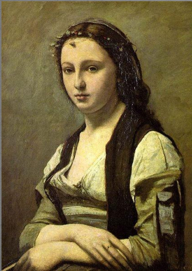
Woman with a Pearl, 1868-70, Paris: Musée du Louvre.

Jean-Baptiste-Camille Corot was a French landscape painter and Portrait painter as well as a printmaker in etching. Corot was the leading painter of the Barbizon school of France in the mid-nineteenth century. He is a pivotal figure in landscape painting and his vast output simultaneously references the Neo-Classical tradition and anticipates the plein-air innovations of Impressionism.