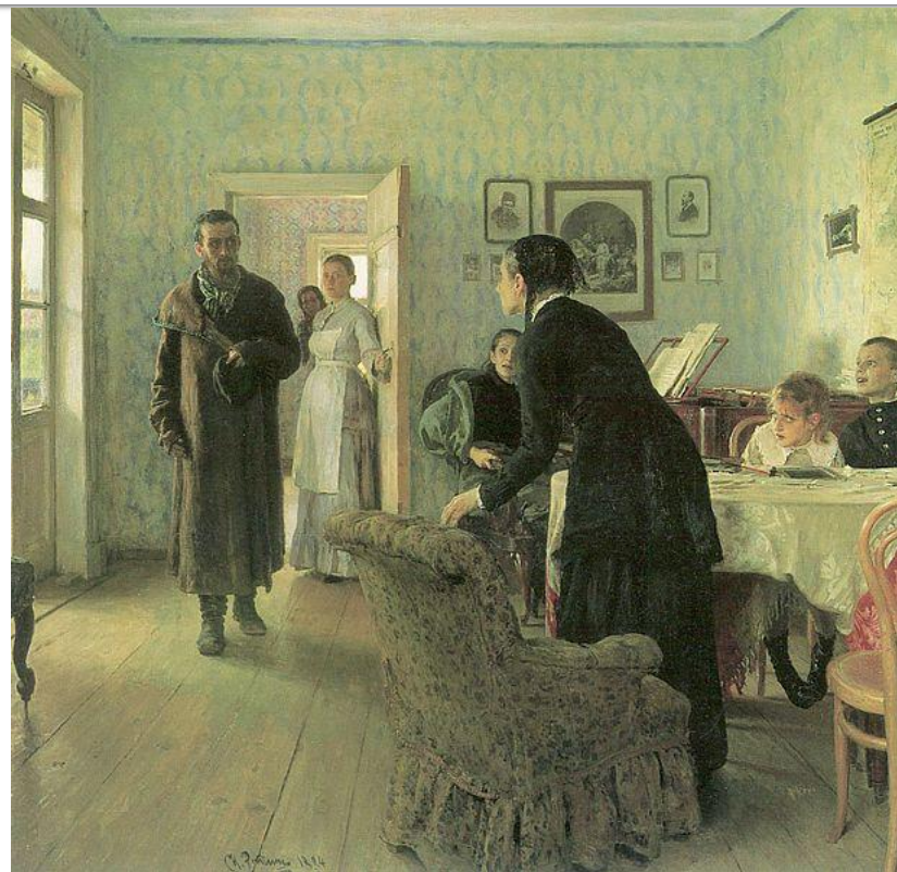
Ilya Repin, They did not expect him , 1884-1888.

In its most specific sense, Realism was an artistic movement that began in France in the 1850s, after the 1848 Revolution. [1] Realists rejected Romanticism, which had dominated French literature and art since the late 18th century