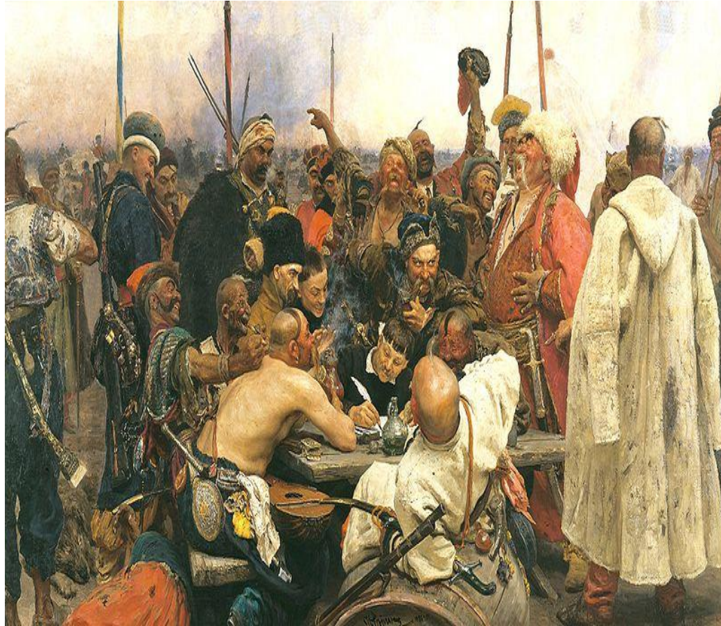
Cossacks write a letter to the Turkish Sultan

Ilya Yefimovich Repin 1844 - 29 September 1930 was a leading Russian painter and sculptor of the Peredvizhniki artistic school. An important part of his work is dedicated to his native country, Ukraine. His realistic works often expressed great psychological depth and exposed the tensions within the existing social order.