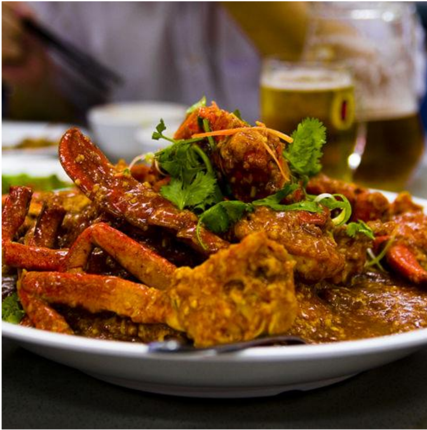
A plate of chilli crab