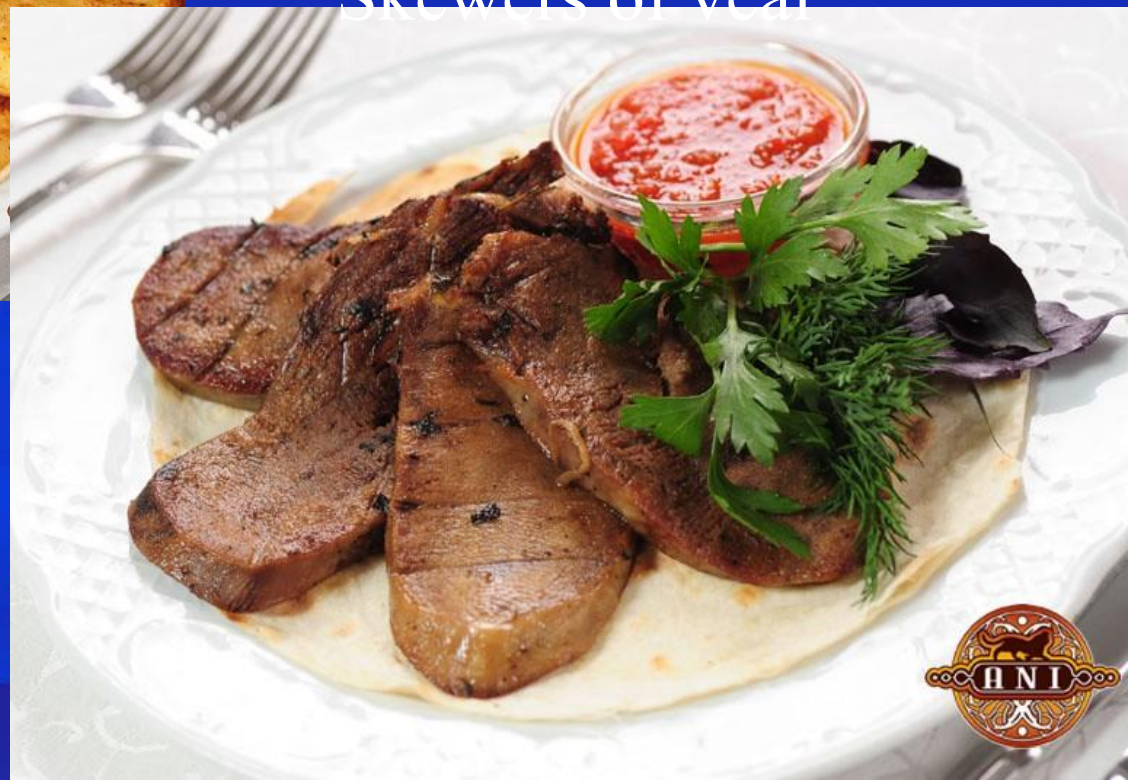
Skewers of veal