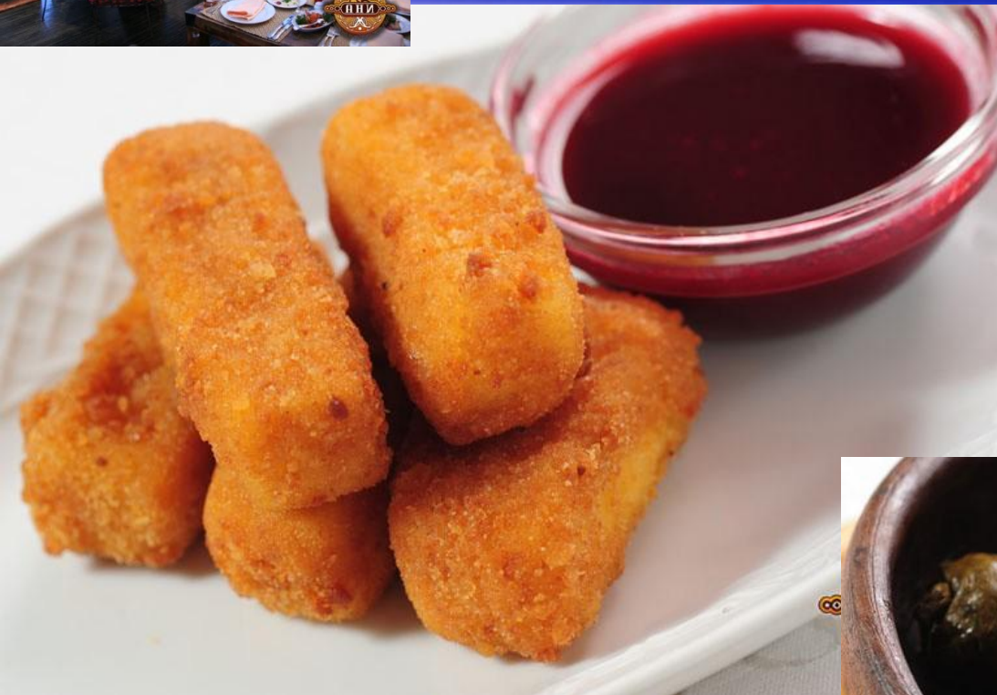
Potatoes in the tandoor